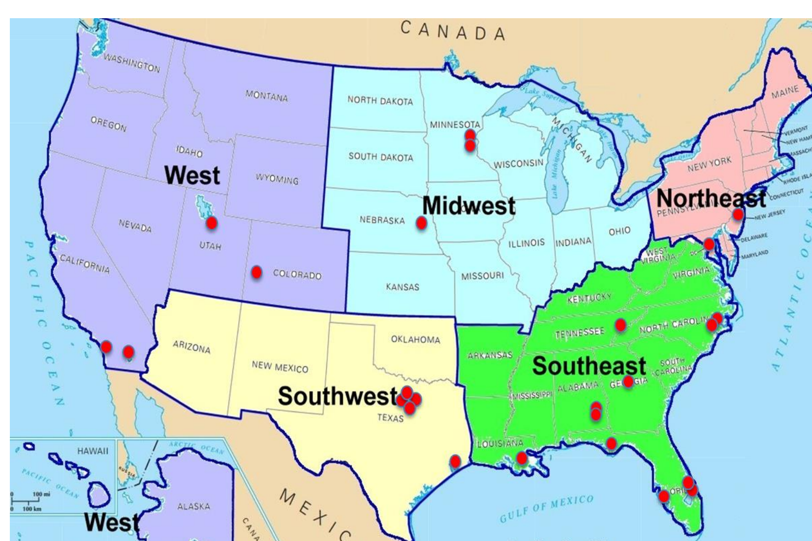
Figure 1. Mosquito Collections