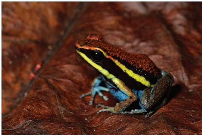
Figure 1. Ameerega cainarachi , a poison frog endemic to Peru that demonstrates aposematism — the combination of bright warning coloration and a secondary defense (here, toxicity).

many high school students and some early undergraduates possess (Preszler, 2009).