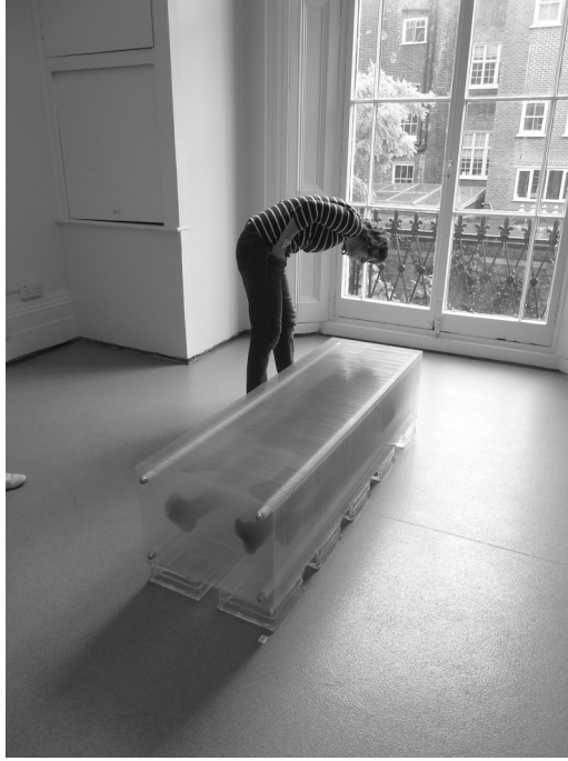
Figures 18.3 and 18.4 Attempting to see the body in Between a Rock and a Hard Place, exhibited in ‘This is My Body’, Birkbeck and Irish Museum of Contemporary Art, July 2011.