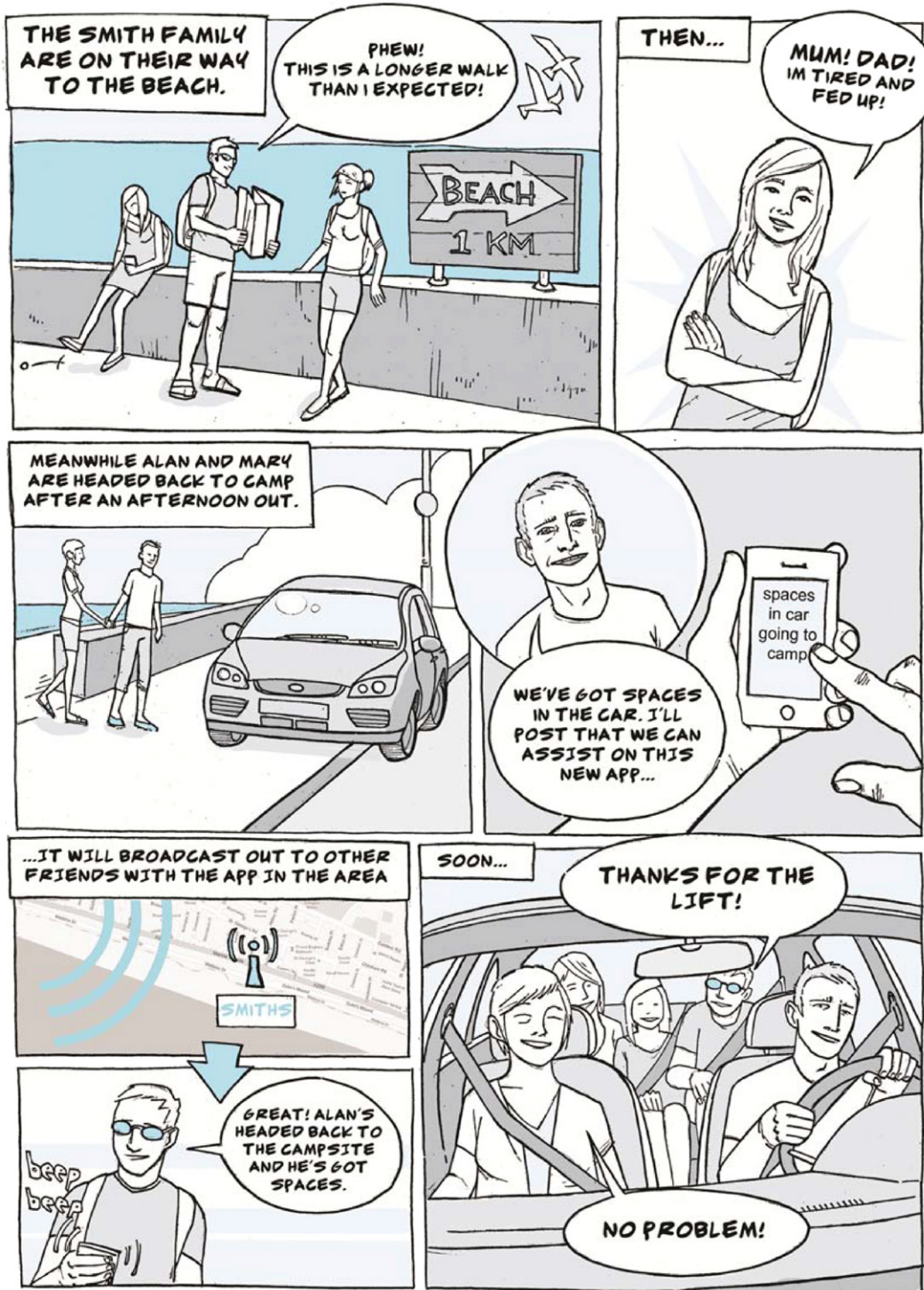
Fig. 1. Lift share scenario.

concerns about exploitation by other users and commitments to the exchange process. Items on safety focused on concerns about safety during collaborative travel which, given the unique nature of the trial, were developed specifically for the study. Privacy measures were adapted from Buchanan et al.'s (2007) online privacy scale to reflect the mobile context. The items on trust focused on generalised trust in the campsite community rather than personalized trust, though there is some overlap as campsite tourists can know other visitors on the campsite. Exploratory interviews suggested honesty and benevolence as sub-latents of trust were transferable to the app scenarios and items were derived