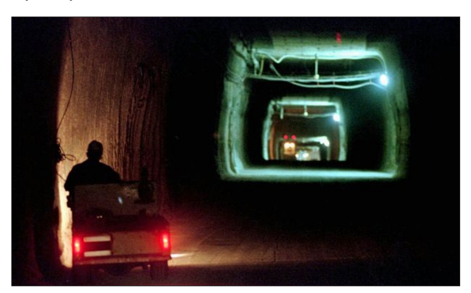
Construction of the Waste Isolation Pilot Plant in New Mexico, an underground nuclear waste dump.

In 1981 the research field of 'nuclear semiotics' was born. A group of interdisciplinary experts was tasked with preventing future humans from intruding on to a subterranean storage facility for radioactive waste, then under construction in the New Mexico desert. The half-life of plutonium-239 is around 24,100 years; the written history of humanity is around 5,000 years old. The challenge facing the group was how to devise a sign system that could semantically survive even catastrophic phases of planetary future, and that could communicate with an unknown humanoid-to-be.