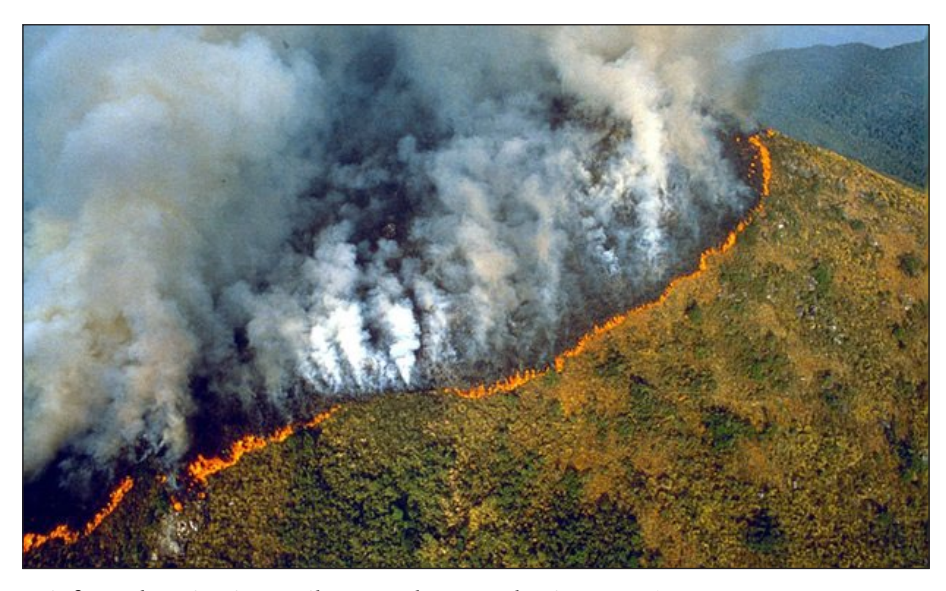
Rainforest burning in Brazil, 1989.

There are good reasons to be sceptical of the epitaphic impulse to declare 'the end of nature'. There are also good reasons to be sceptical of the Anthropocene's absolutism, the political presumptions it encodes, and the specific histories of power and violence that it masks. But the Anthropocene is a massively forceful concept, and as such it bears detailed thinking through. Though it has its origin in the Earth sciences and advanced computational technologies, its consequences have rippled across global culture during the last 15 years. Conservationists, environmentalists, policymakers, artists, activists, writers, historians, political and cultural theorists, as well as scientists and social scientists in many specialisms, are all responding to its implications. A Stanford University team has boldly proposed that – living as we are through the last years of one Earth epoch, and the birth of another – we belong to 'Generation Anthropocene'.