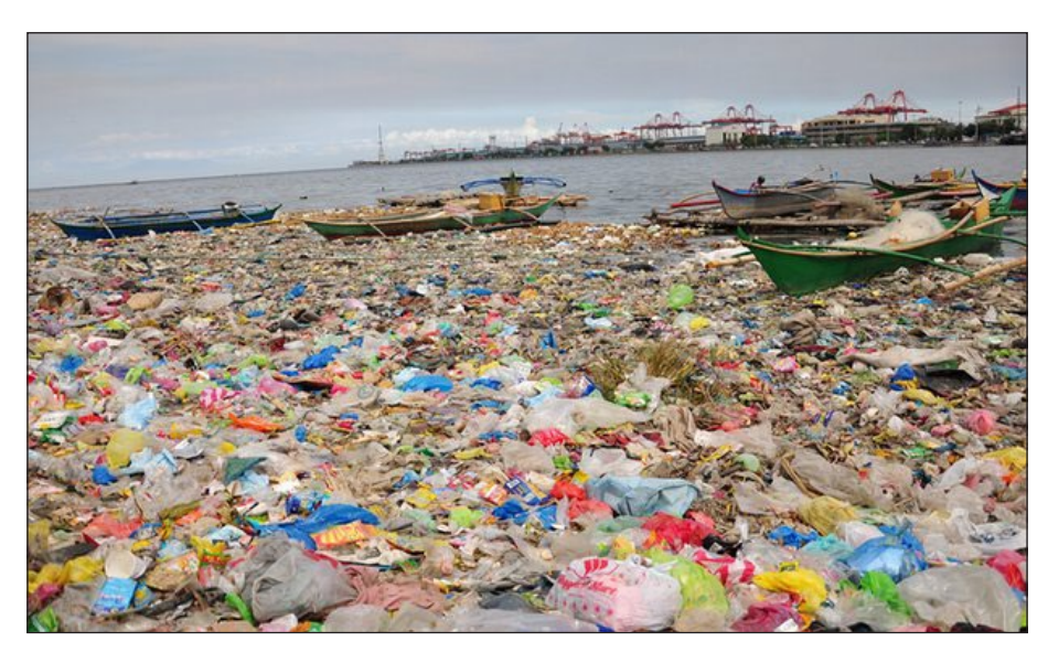
Manila Bay in the Philippines covered with plastic bags and rubbish.

Plastics in particular are being taken as a key marker for the Anthropocene, giving rise to the inevitable nickname of the 'Plasticene'. We currently produce around 100m tonnes of plastic globally each year. Because plastics are inert and difficult to degrade, some of this plastic material will find its way into the strata record. Among the future fossils of the Anthropocene, therefore, might be the trace forms not only of megafauna and nano-planktons, but also shampoo bottles and deodorant caps — the strata that contain them precisely dateable with reference to the product-design archives of multinationals. 'What will survive of us is love', wrote Philip Larkin.¹² Wrong. What will survive of us is plastic — and lead-207, the stable isotope at the end of the uranium-235 decay chain.