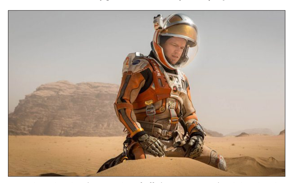
'It's easier to imagine the extraction of off-planet resources than it is to imagine the end of capitalism' . . . Matt Damon in The Martian.

addressing the enormity of this new epoch? Any Anthropocene-aware novel finds itself haunted by impersonal structures, and intimidated by the limits of individual agency. China Miéville's 2011 short story 'Covehithe'<sup>34</sup> cleverly probes and parodies these anxieties. In a near-future Suffolk, animate oil rigs haul themselves out of the sea, before drilling down into the coastal strata to lay dozens of rig eggs. These techno-zombies prove impervious to military interventions: at last, all that humans can do is become spectators, snapping photos of the rigs and watching live feeds from remote cameras as they give birth – an Anthropocene Springwatch .