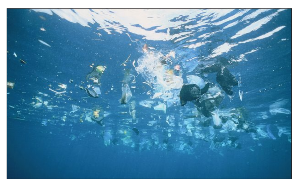
Plastic and rubbish floating in the ocean.

millennia – let alone shape the nature of that change? The indifferent scale of the Anthropocene can induce a crushing sense of the cultural sphere's impotence.