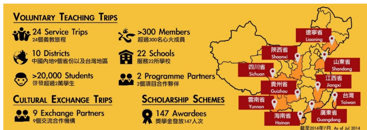
Figure 3 HeartFire's Service Learning Activities (as of July 2014)

place, HeartFire is dedicated to creating a service platform that benefits the served community in the long-term. Figure 3 summarizes HeartFire's footprints up to July 2014.