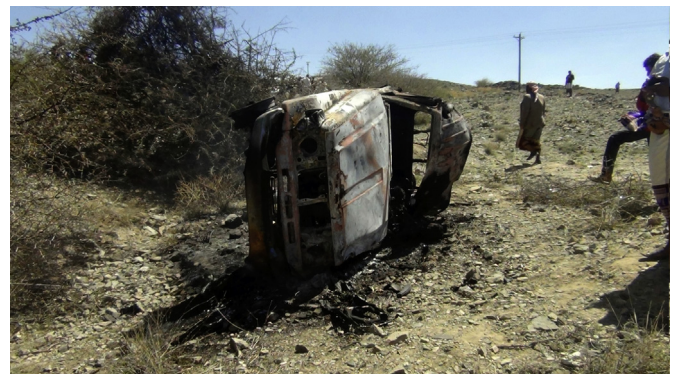
Fig. 1. Car targeted by reported strike in Sawmaa area of al-Bayda province, Yemen, 19 April 2014.

The consequences of this representation for newsreaders' ethical orientations towards strike violence can be elaborated through visual coverage of strike debris. In purporting to visualise an event that was seemingly not documented for the public, photographs of debris emphasise that these are spaces not of state action but of its disintegration. A typical Associated Press report of a strike in Yemen on 19 April 2014 hints at the unseen violence of a strike through its after-effects ( Associated Press , 2014, Fig. 1). Against claims from a “civilian survivor” that the strike “tossed [an SUV] some 20 m away”, producing “flying debris” and “explosions