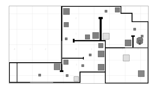
Fig. 1. 2D Stage world S_1 used in the Pioneer STL phase