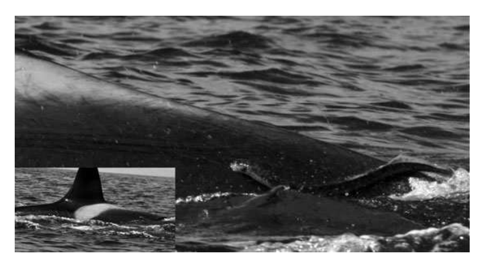
Figure 1. Sea lamprey (Petromyzon marinus) attached to an adult male killer whale with location of attachment on body shown in the lower left corner.