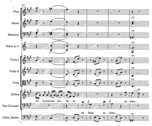
Example 3 W. A. Mozart: Don Giovanni, "Là ci darem," mm. 45–49

with the winds playing a key role. Sonorous wind sounds accompany Elvira's initial statement, including sustained notes and phrase-to-phrase links (see mm. 3-6, 8-9, 12-13). Don Giovanni takes care not just to match them in his own statement but to take them a stage further as well, in an attempt to convince Elvira of his "love" for her: the meticulous three bars of preparation for his deceitful address feature the sustained horn note from Elvira's presentation as well as a full complement of winds (2 flutes, 2 clarinets, 2 bassoons, 2 horns, mm. 18-19); his phrase-to-phrase links add two flutes to the wind complement of two clarinets and two bassoons included for Elvira, in effect smoothing the sonic divide between the link and the sustained note by having the flutes' sustained b2 grow directly out of the link rather than (as is the case in Elvira's corresponding flute e2) existing independently of it; and the returning sustained horn note (mm. 29-30), echoing Elvira's again, follows immediately after her