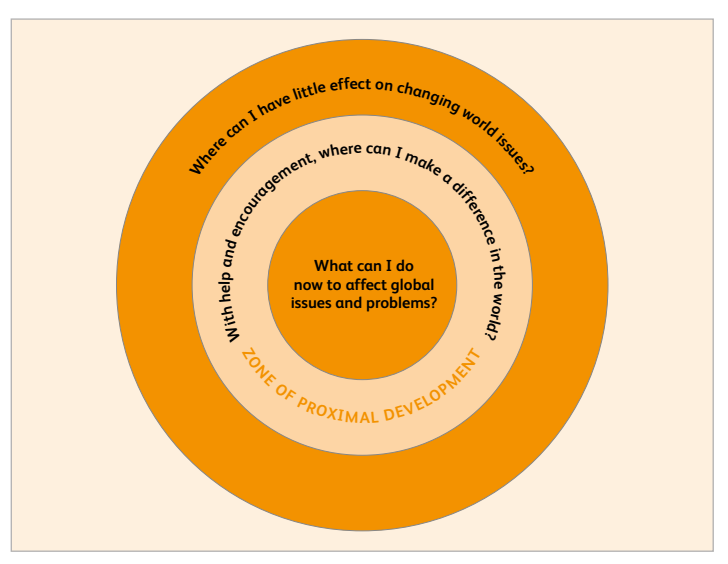
FIGURE 1 Academic Practice for Global Ctizenship: Zone of Proximal Development

Global issues today certainly involve oppression. Let's consider, for example, terrorist acts. They leave communities feeling fearful even as people go about their everyday lives, sitting in coffee shops and attending concerts. Similarly, we identify with the human despair of the enormous refugee migration across Europe. In much the same fashion, students understand how such global issues affect their identities. Academic practices that engage in this kind of reflection can encourage student discussions about how these issues make them feel; and how these issues impact students, and their families and friends. This dialogue can bring to light the struggle experienced by students who confront these issues. It constitutes an act of humanity as opposed to the inhumanity that lies, as Freire tells us, at the heart of the oppressor's violence. This conversation can unearth students' relationships with the world, their perception of these issues, and bring these themes down to the level of personal impact. Student self-awareness will then become a catalyst