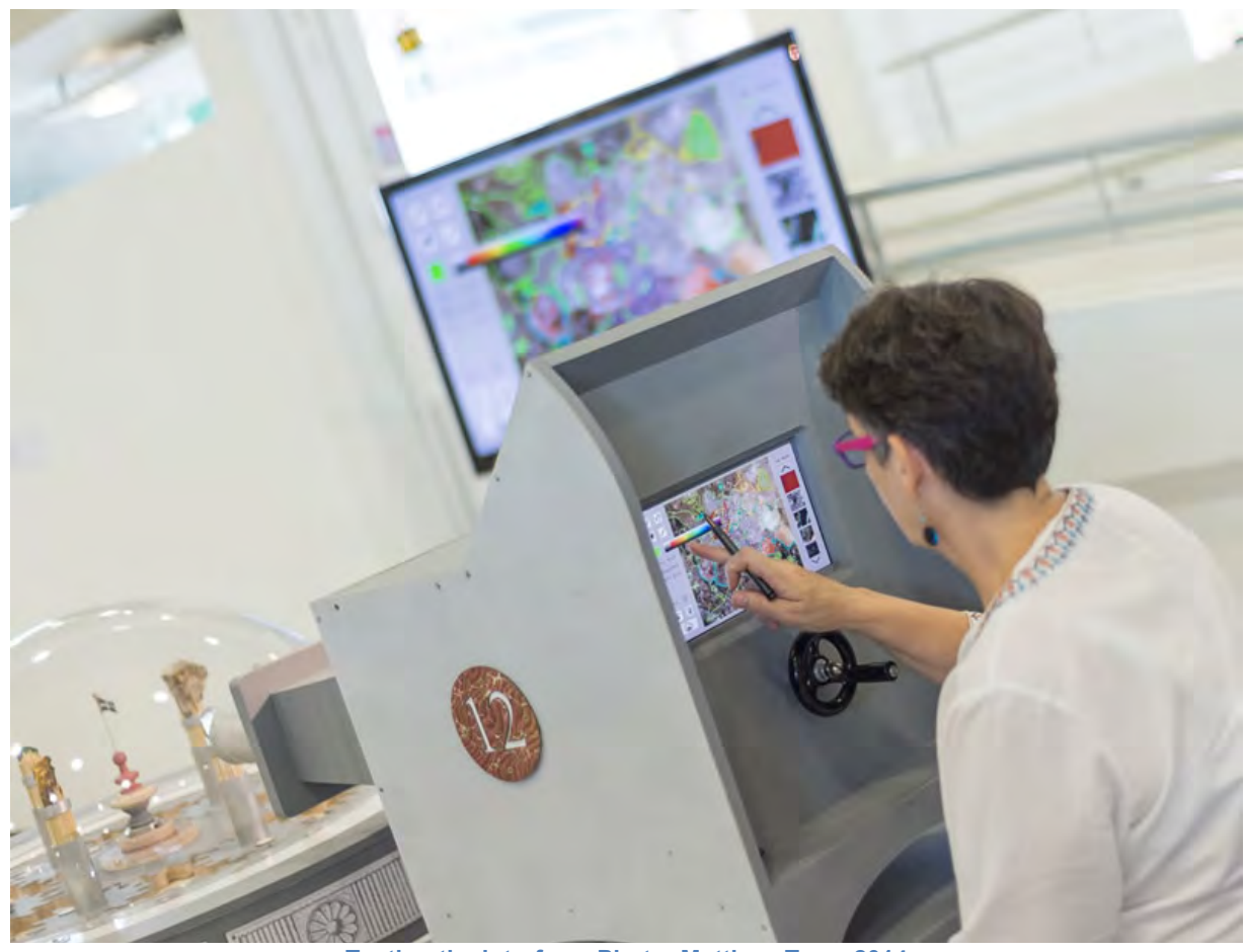
Testing the interface. 2014

The museum visitor is invited to draw directly over the microscopic images of the minerals, this invitation supported by the suggestion that images may be seen within the morphology of the rock structure, landscapes faces and other visual associations can be unearthed and isolated. This process allows for a playful or a serious relationship to be made with the specimens. The mineral samples a drawn from the Museum's own collection and very local and connected strongly to Cornish mining history and culture. To be in a museum tracing and annotating curious and beautiful structures from deep in the earth may also place the visitor in the shoes of the eighteenth century gentleman scholar, recreating the taxonomic process of closely observing, identifying and recording mineral samples before the advent of photography.