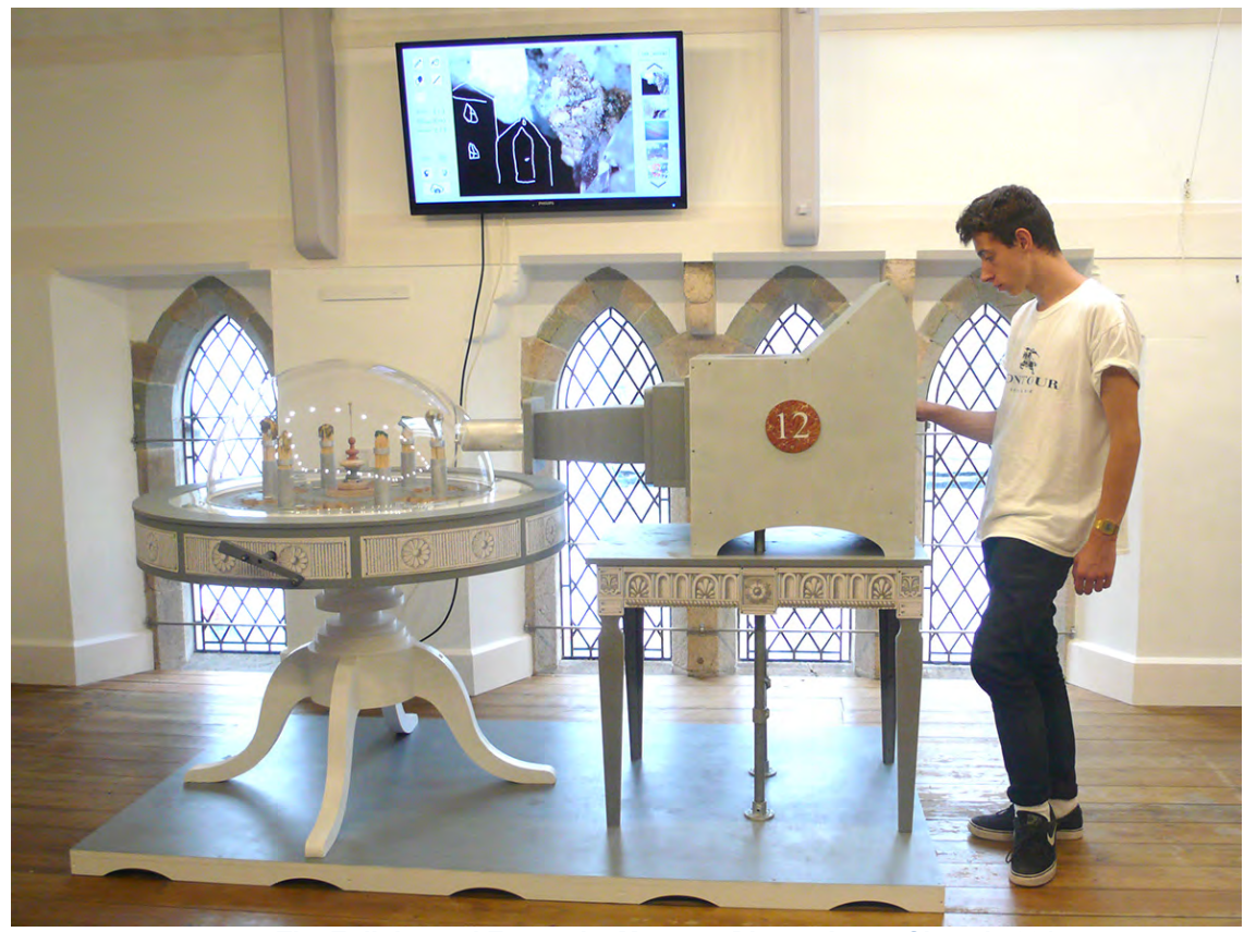
The Enlightened Eye at the Museum Photo: Jason Cleverly 2014

The Enlightened Eye is experimental, speculative and actually treads a difficult path, in designing a multifaceted, multi-modal structure (an assembly to be sited in a public place with a mixed agenda) such as The Enlightened Eye , generates conflicting positions; a responsibility to curatorial procedure, to visitor amusement and interaction, and the self-indulgent aesthetic and technical predilections of the artist-designer (craftsman).