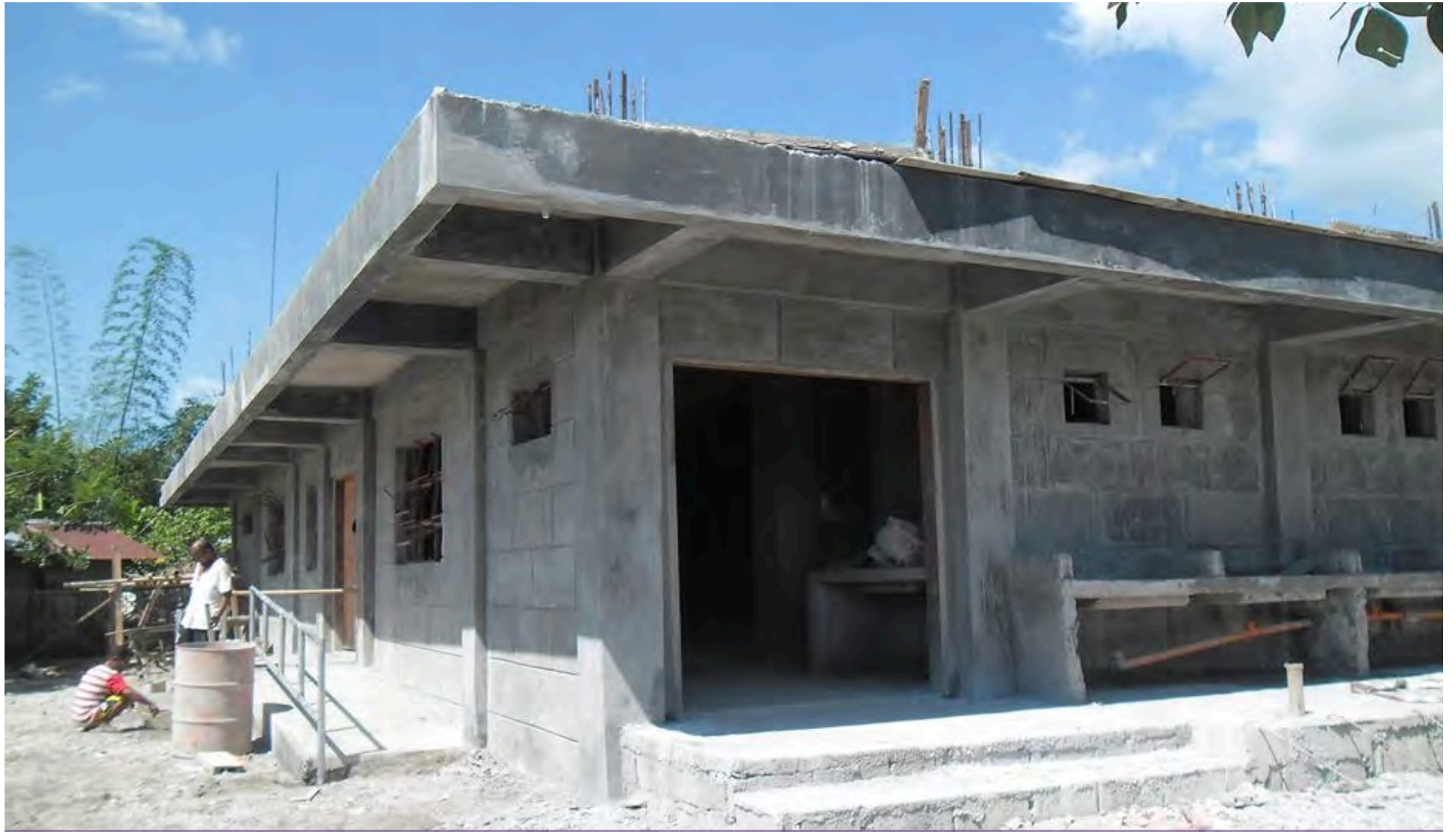
Community Co-Designed and Managed Evacuation Center