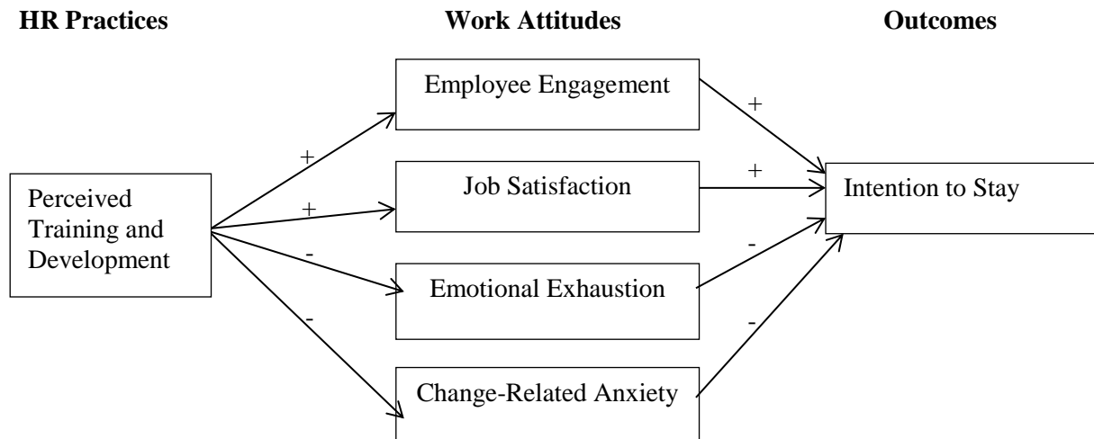
Figure 1. Illustration of the hypothesized model being tested