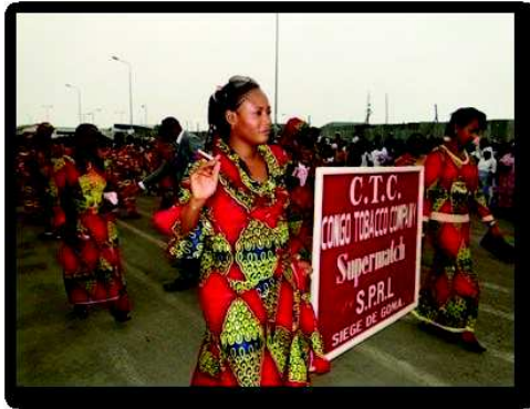
Congo Tobacco Company Celebration of Women in Goma, Eastern DRC, on Women’s Day, March 8 2012

Marketing to women and girls who, in LMICs, have lower rates of smoking than men, is also widespread. 50 51 Efforts include using ‘trend setters’ to promote and normalise the image of the African woman smoker (see below) in an attempt to mollify the cultural barriers to female smoking. The industry’s success is evidenced by the rising uptake of smoking in girls in many developing parts of the world. 24