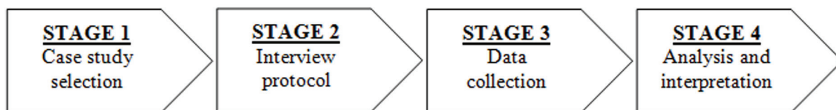
Figure 2. The case study methodology

Eight companies were involved in the survey: four Swedish, two Italian and two Irish. While the countries share some features, the LSP industry differs in many respects (e.g. in Italy the market comprises a multitude of small 3PLs while in