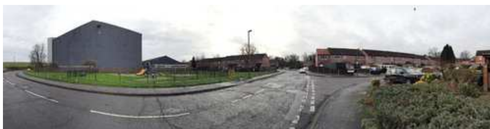
Figure 4. An exterior shot of Shepperton Studios' Stage H, which towers over the neighbouring council houses on the estate.

Before examining Living Film Set as a site of contestation to 'reality theatre', I should first establish that the unassuming suburban town of Shepperton that was the geographical setting of the early childhood memories re-enacted in the play are an anomaly in two key respects. Firstly, Shepperton has been apprehended as a backdrop in numerous works of literary science fiction. Secondly, it is a place that has been physically transformed by the activities of Shepperton Film Studios since the early 1930s. 10