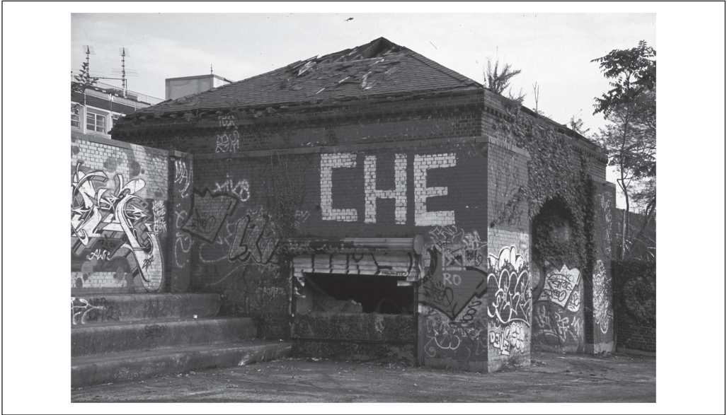
Figure 7. McCarren Park (2002). Some of the older pool residents lived in this structure of the pool. Its interior had been damaged by fire.