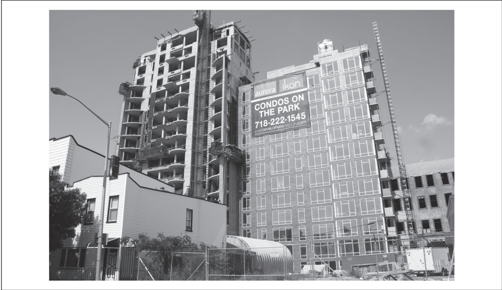
Figure 9. Luxury condominiums built next to McCarren Park (2006).