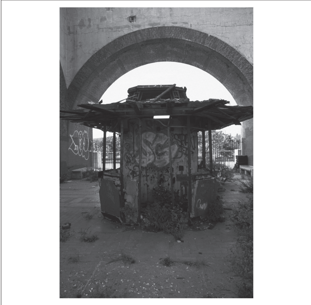
Figure 1. The old ticket booth (2002).