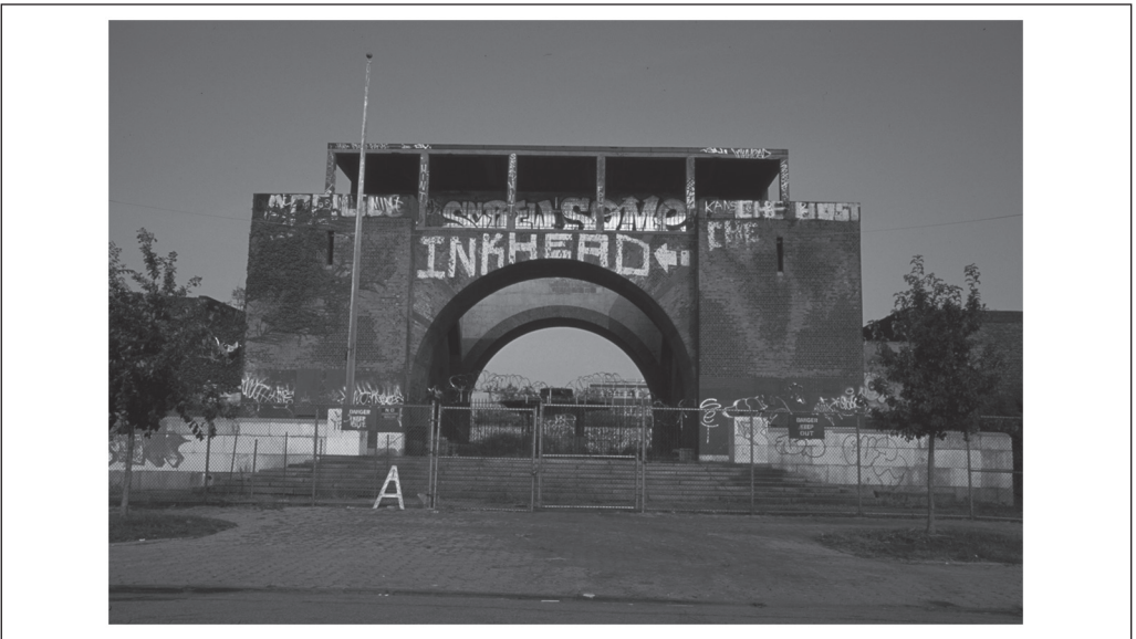
Figure 8. The pool entrance as seen from Lorimer Street, McCarren Park (2002). The police would monitor the pool whenever new graffiti pieces appeared in the façade.