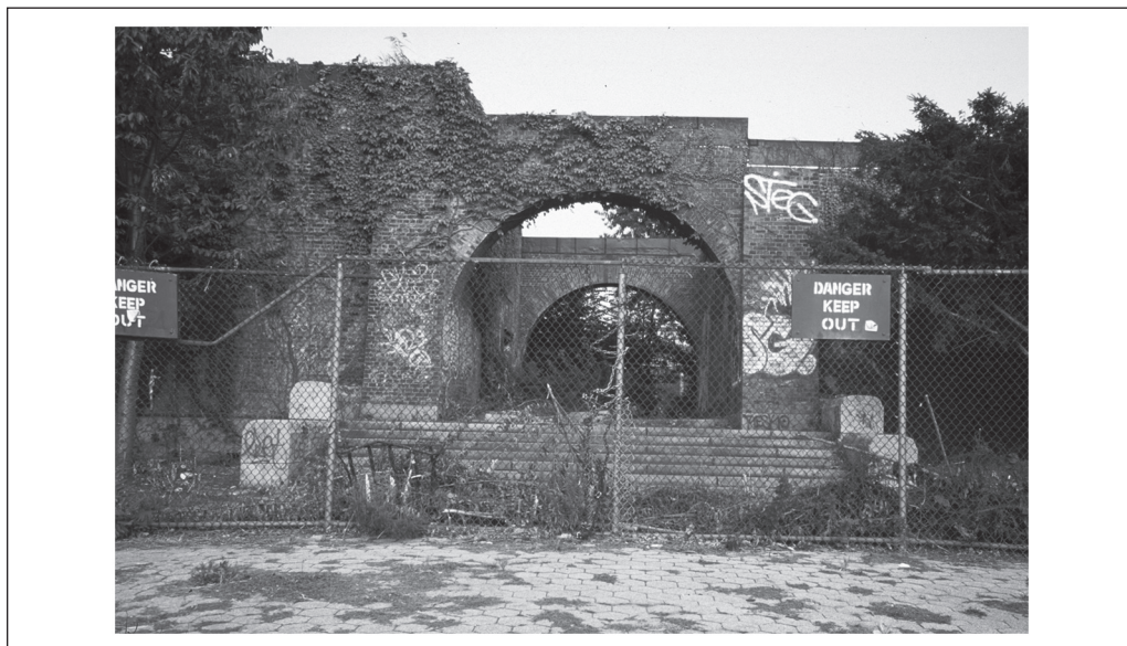
Figure 3. South wing arches, McCarren Park (2002). The “Danger Keep Out” signs gave a misleading impression about the structure. Some people thought that this was an abandoned power plant.

passersby gave them spare change. Having lived in Midtown for a long time, these homeless had established networks with local storekeepers who would sometimes pay them to do odd jobs (Ethnographic Research, 1996-1998).