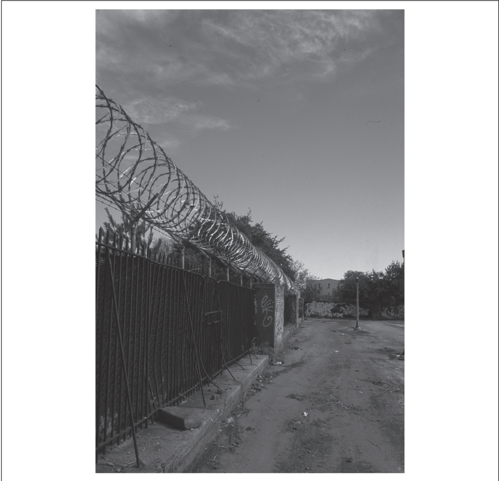
Figure 4. Fortifications outside McCarren Park (2002), showing the coexistence of fencing from different eras. Various types of fortification from different eras coexisted.