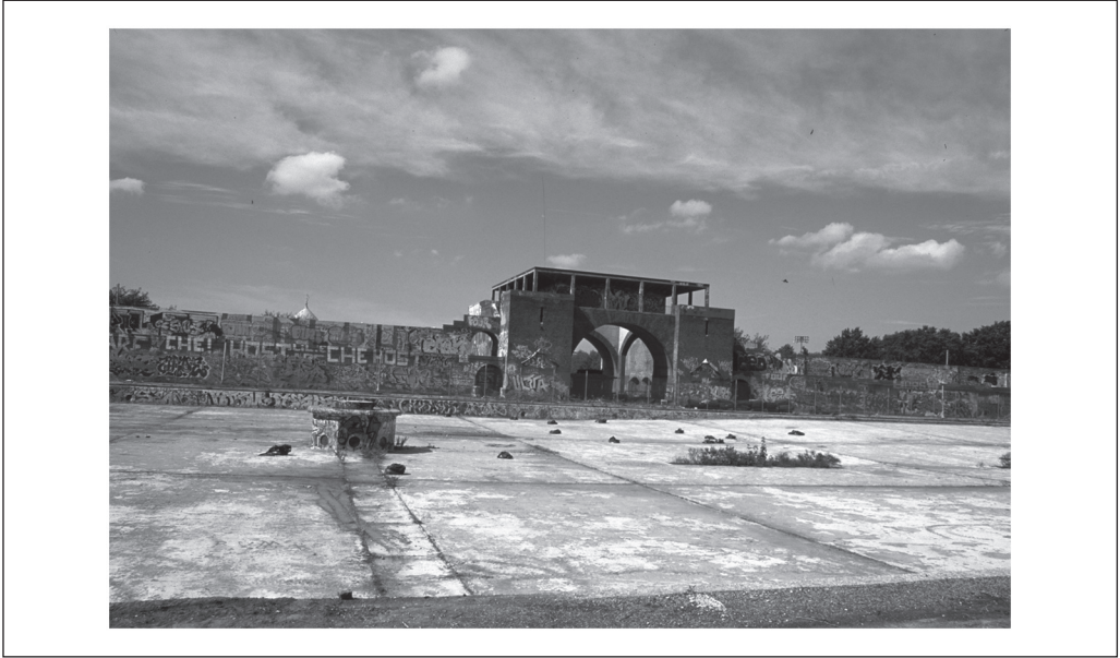
Figure 5. The sizable main area of the pool, McCarren Park (2002). Homeless people would hang out in groups throughout this area after the pool's closure in 1983.