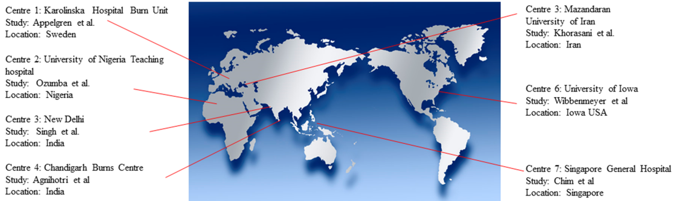
Figure 3. Geographic distribution of the centres from which studies were critically appraised. The study design and sample size are provided in figure 2.