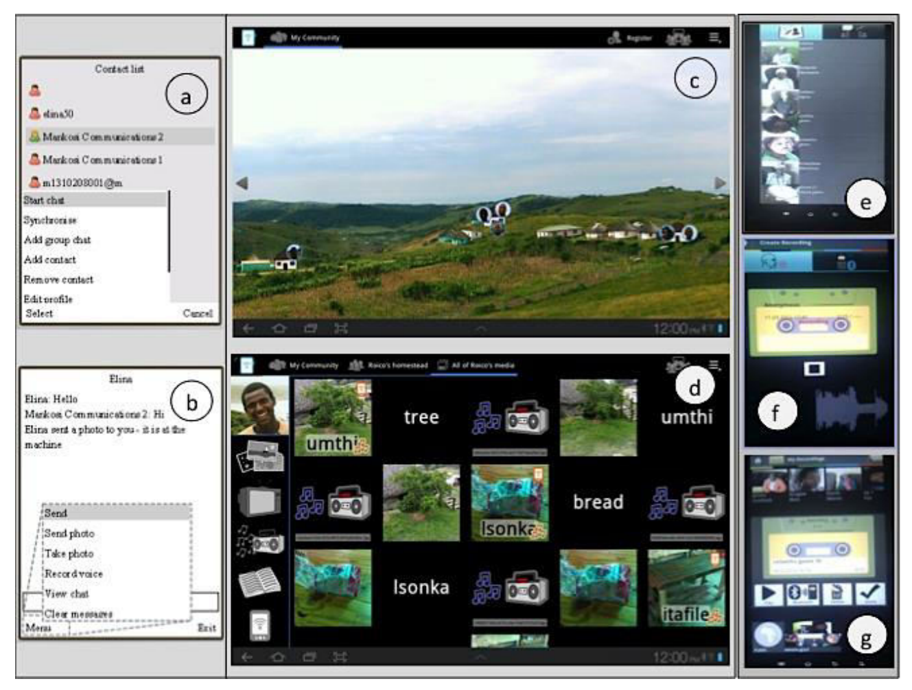
Figure 2. MXShare's client enables real-time chat (b) and synchronises media between users' phones and the browser (a). MX-Share's browser to find users' accounts (c) and media (d). AR's interfaces to find users' accounts (e) and, record (f) and share voice-files (g) [2]