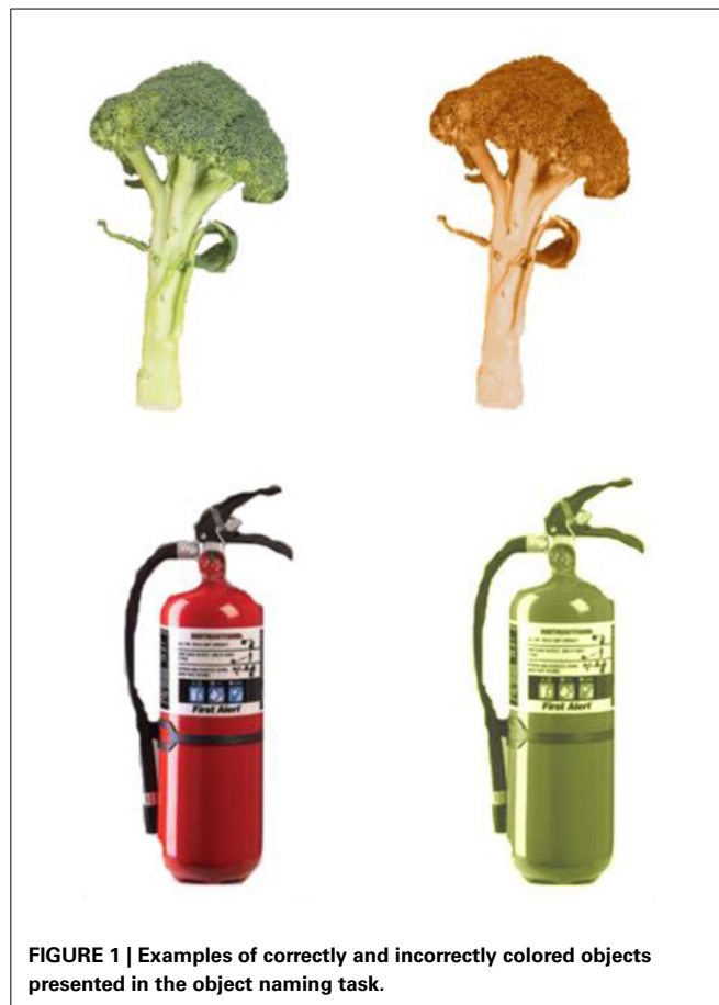
FIGURE 1 | Examples of correctly and incorrectly colored objects presented in the object naming task.

The experiment comprised two phases: (a) a study phase where correctly and incorrectly colored objects were named followed by (b) a test phase in which a lexical-semantic matching task