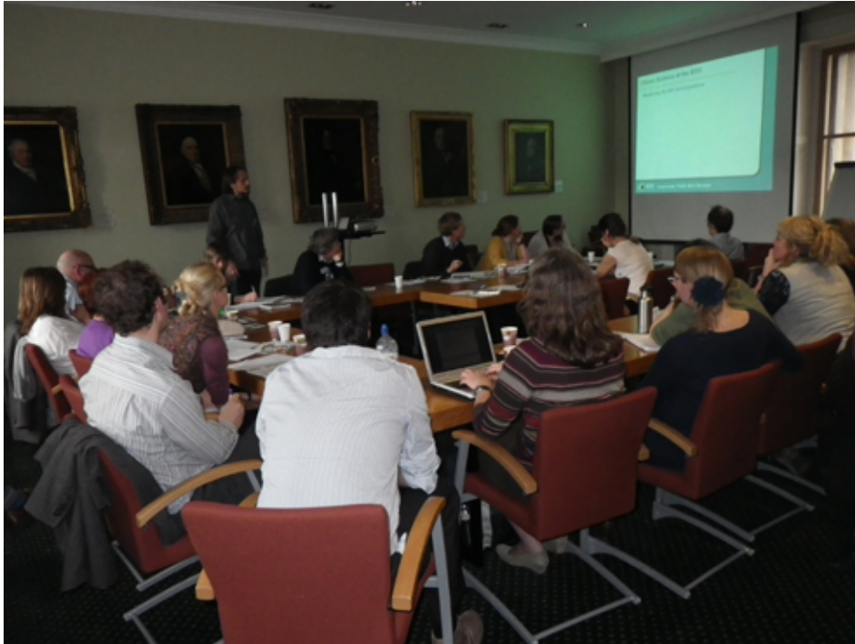
Figure 3. Participants at the workshop at the Linnean Society, London.

Communication and integration amongst marine recording schemes needs to be fostered by leadership from key organizations. For example, the MBA and Biological Records Centre can speak for the community and pull all the elements (data, science and policy needs, publicity etc.) together. This should not be a “top-down” approach; rather the aim should be to ensure that the volunteer recording community is getting what it wants.