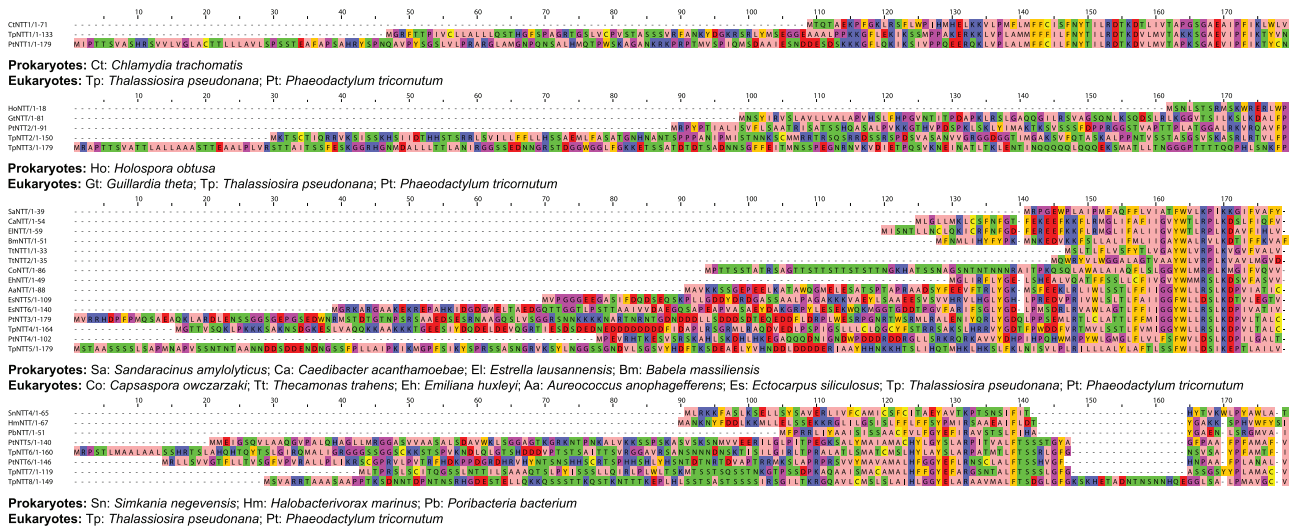
Fig. 3. —Diatom NTTs gained N-terminal extensions on multiple independent occasions. In addition to the NTT that they share with primary plastids, diatom NTTs appear to have independent bacterial origins. These genes might be involved in energy transfer across the multiple internal membranes of these secondarily photosynthetic eukaryotes, and not all diatom NTTs have in silico detectable N-terminal targeting signals (Ast et al. 2009; Chu et al. 2017). Our phylogeny allows direct comparison of Diatom NTTs to their close bacterial relatives and so reveals significant elongations at their N-termini. The role of these sequences in protein targeting to the organelle remains to be evaluated experimentally.