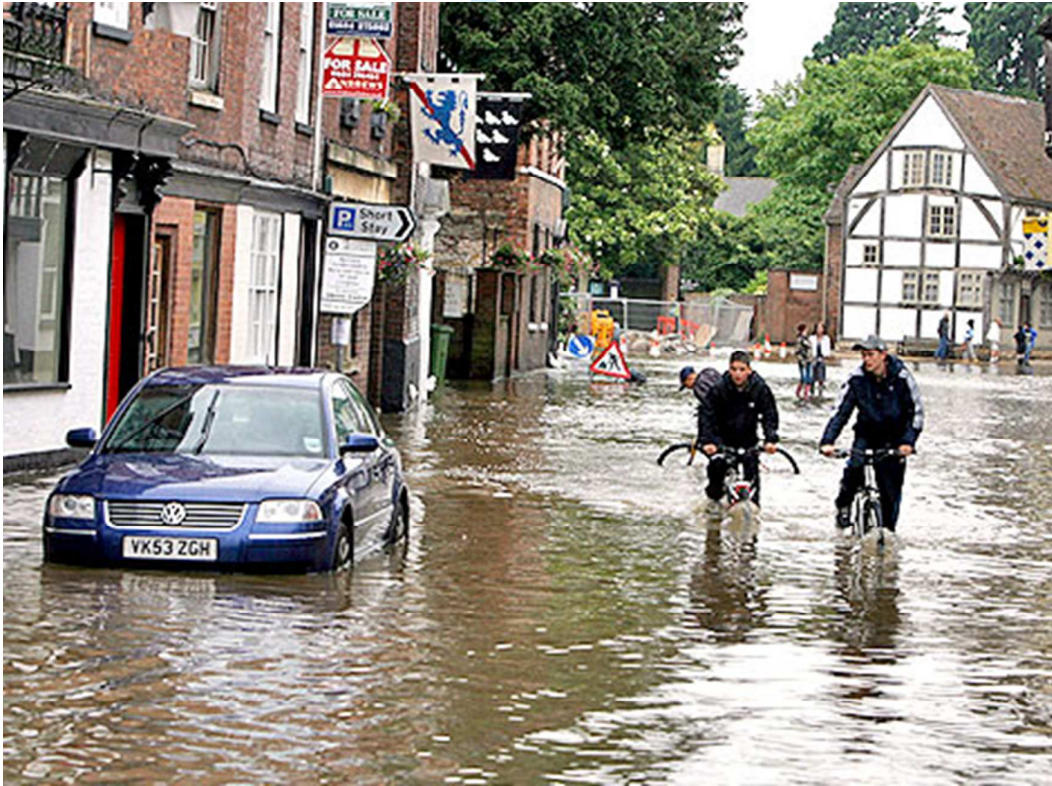
Fig 2. The cycle of recovery