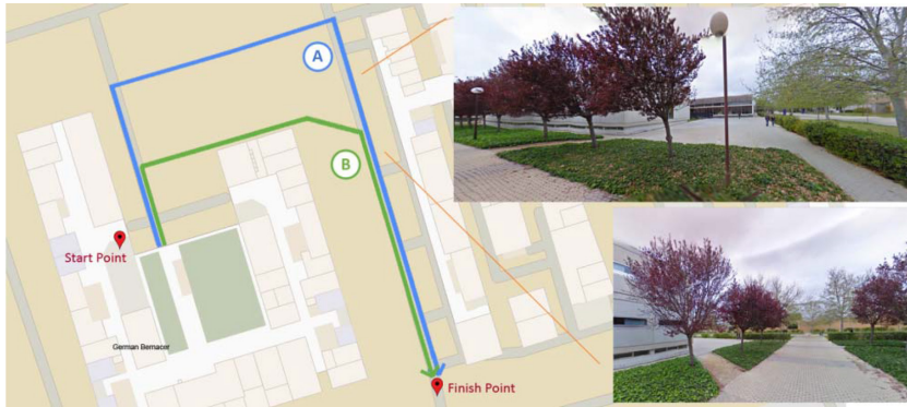
Figure 3: Different routes detected because of problems with movement (2).