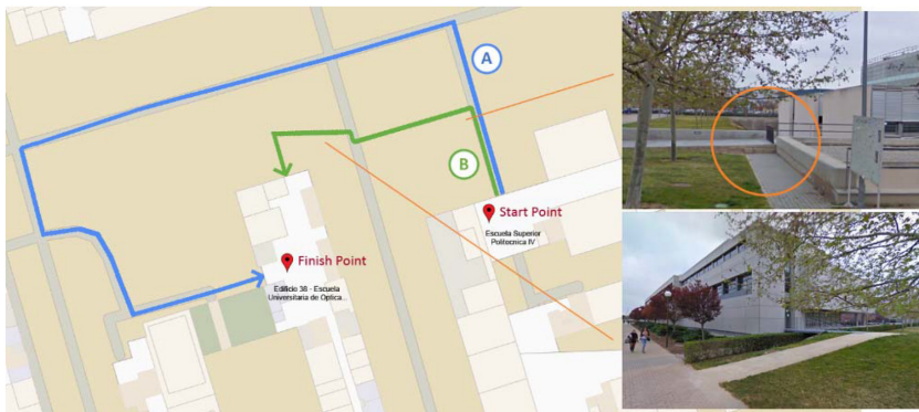
Figure 2: Different routes detected because of problems with movement (1).

The results shown in Figs 2 and 3 have been obtained by analysing the GPS routes sent to the server through the citizens' mobile devices. The route that is finally shown is the diagram resulting from the combination of the read routes during a period of time. For the purpose of experimentation, it is necessary to count on the cooperation of students with and without disabilities who voluntarily configure their mobile devices to communicate the paths followed inside the campus to our server. Thus, the privacy issues are also avoided.