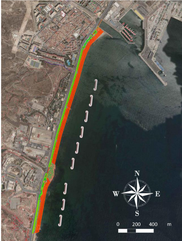
Figure 6: submerged breakwaters.