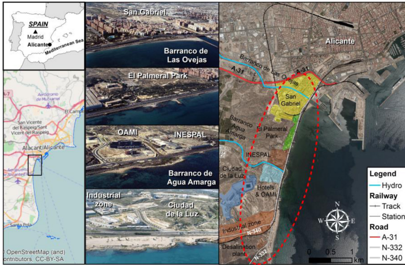
Figure 1: Study area.

been the urban development of the city. However, nowadays it is one of the sectors of the municipality in which the prospects for development and economic revitalization are more obvious, because its area of influence has the presence of OIMA (Office for the registration of trademarks, drawings and models of the European Union), the audio-visual complex Ciudad de la Luz film school and the British School of Alicante.