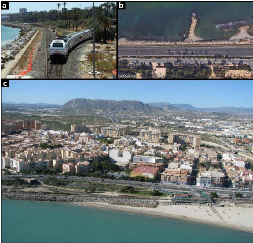
Figure 2: (a) Reversal railway (b) View national road, railway and Palmeral Park (c) View San Gabriel national road and railway.

The solution adopted for the design of the promenade has been developed to maintain the same structure of the surrounding areas of Alicante. A bike path was included, which is linearly along the promenade and all the way to the beach (Fig. 3).