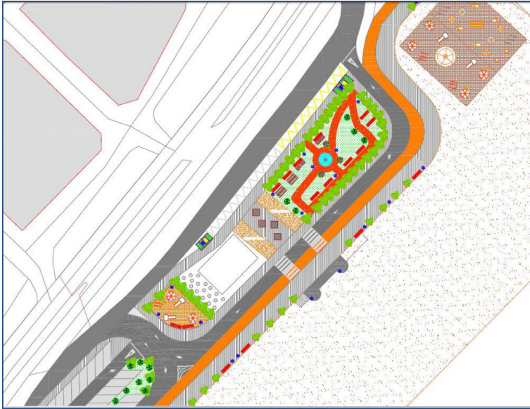
Figure 4: Parks and recreation areas.