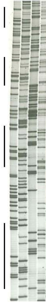
Fig. 1. Autoradiograph of an unpublished Sanger sequencing gel, dated 21/08/1992, where regularly spaced repeats were discovered in H. mediterranei . Repeats are marked with side bars.