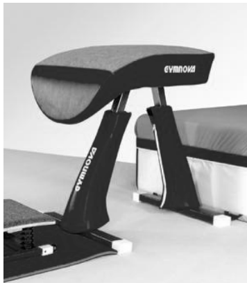
Figure 1. Platform

He machine consists of three parts in the field of jogging a specific a distance 25 m by of international law for gymnastics and panel the glove which length (120 cm) and display (60 cm) and height (20 cm) platform and jumping which in length (120 cm) and display (95 cm) and height (135 cm) for men (125 cm) for women must result the player a jump and one in the championships all of except the Championship a final devices where it needs to displays the quantum leaps of the two different sets of groupware the kinetic platform jumping. And on the player begin all the a jump than standing fixed. The two men stretched out facing the platform and jumping as in the form of (1).