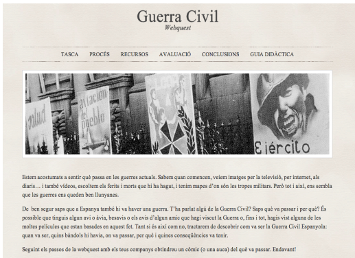
Image 1. WQ Spanish Civil War