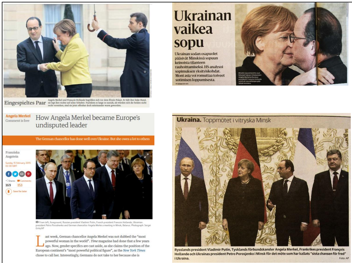
Figure 7. Visualizing Western closeness and Russian isolation.

Sources: Die Welt, February 21, 2015, p. 1 (photo: Thibault Camus/AP); Helsingin Sanomat, February 13, 2015, pp. A2–A3 (photo: Grigori Dukor/Reuters); The Guardian ( www.theguardian.com/commentisfree/2015/feb/15/angela-merkel-germany-ukraine-putin-obama ), February 15, 2015 (photo: Sergei Grits/AP); and Dagens Nyheter, February 12, 2015, p. 14 (photo: AP).