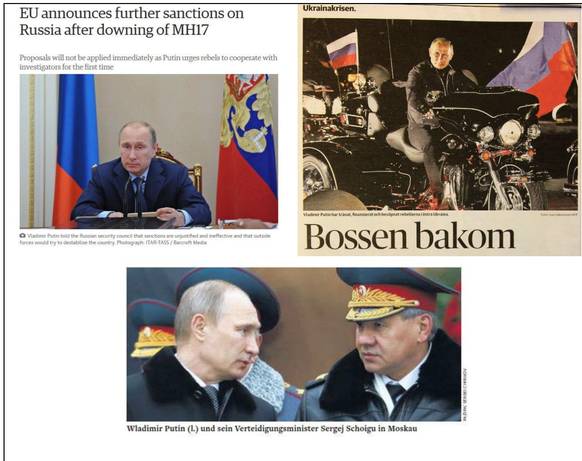
Figure 3. Othering Putin.

Sources: The Guardian ( www.theguardian.com/world/2014/jul/22/eu-plans-further-sanctions-russia-putin-mh17 ), July 22, 2014 (photo: ITAR-TASS/Barcroft Media); Dagens Nyheter, July 24, 2014, p. 4 (photo: Ivan Sekretarev/AFP); Die Welt, February 14, 2015, p. 7 (photo: Sergei Chirikov/DPA).