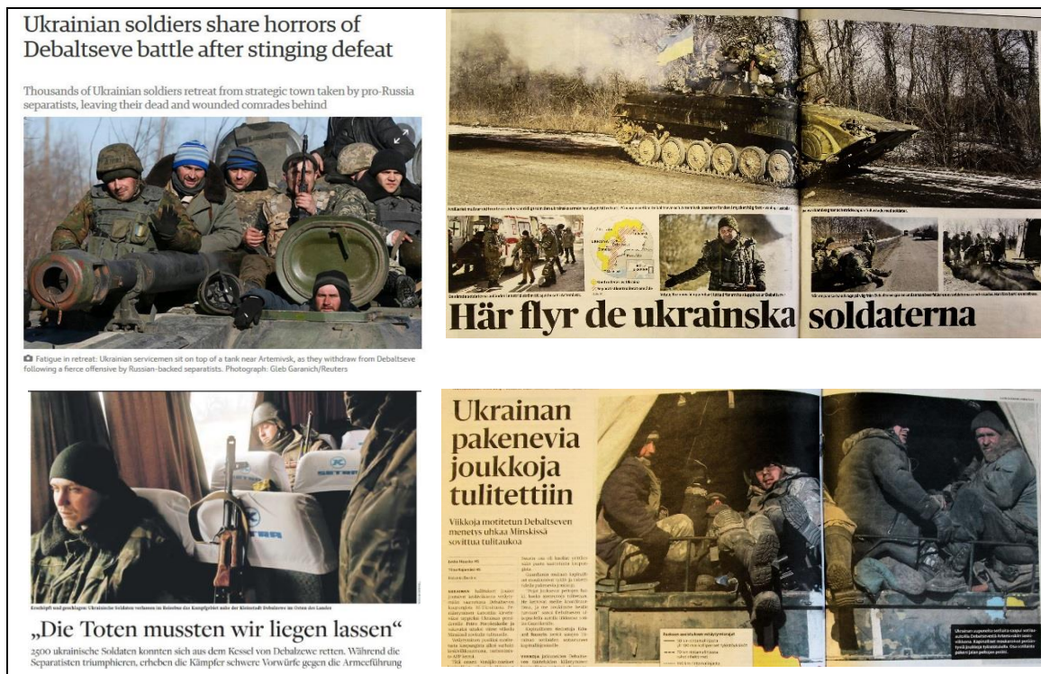
Figure 6. Empathizing with Ukrainian soldiers.

Notably, no such pictures were published of separatist troops. It is also worth noting that the papers customarily labeled the soldiers as “Ukrainian,” so denoting the other party as non-Ukrainian. Additionally, images of the soldiers commonly highlighted Ukrainian flags or Ukrainian colors in the soldiers’ uniforms or equipment.