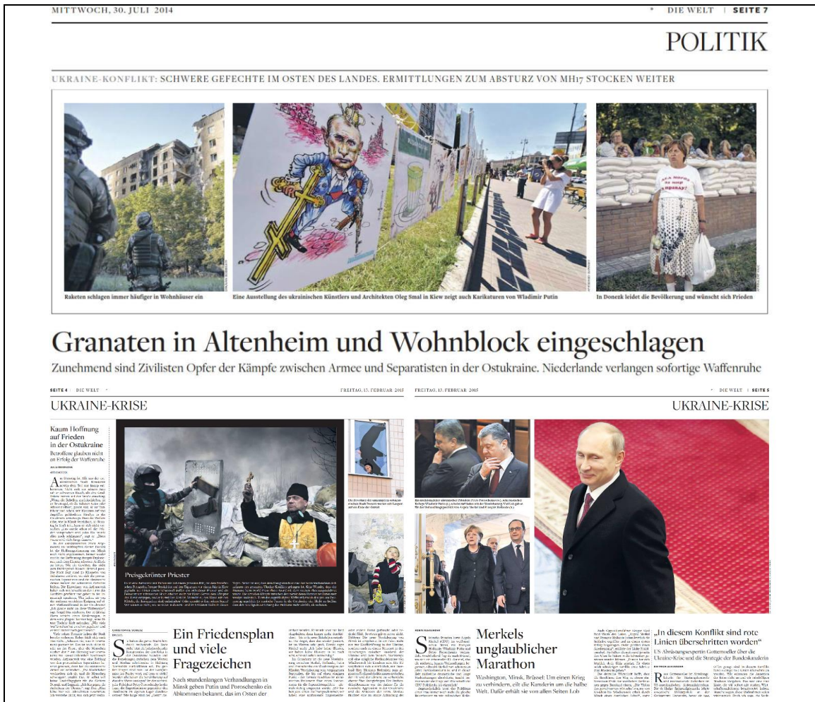
Figure 5. Implying Putin's aggression, power, and responsibility.