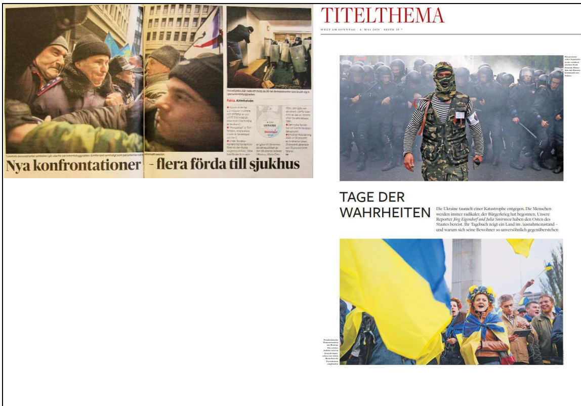
Figure 1. Visualizing a divided nation.