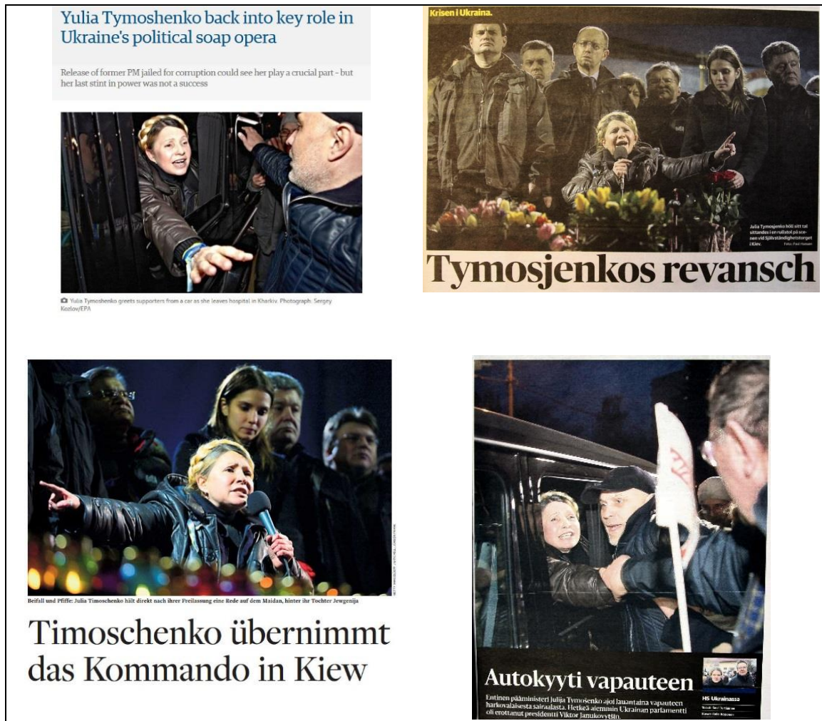
Figure 2. Symbolizing a popular struggle for freedom.

this way, Ukraine's internal political struggles were rendered largely invisible after the Maidan period, and aside from a single article in DN on July 21, 2014, the newspapers featured no images of the leaders of the self-proclaimed People's Republics of Donetsk and Luhansk.