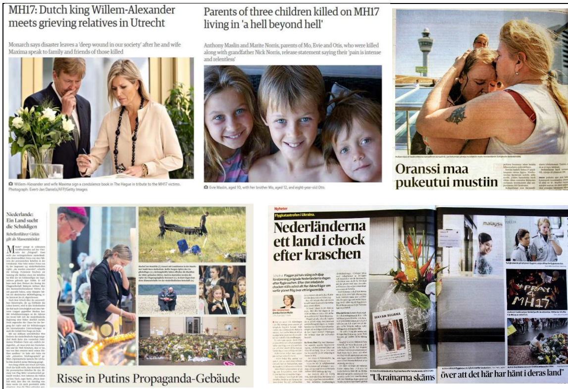
Figure 8. Visualizing Western victimhood.

Sources: The Guardian ( www.theguardian.com/world/2014/jul/21/dutch-king-willem-alexander-meets-mh17-relatives-utrecht ), July 21, 2014 (photo: Ever-Jan Daniels/AFP/Getty Images) and ( www.theguardian.com/world/2014/jul/23/parents-of-three-children-killed-on-mh17-living-in-a-hell-beyond-hell ) July 24, 2014 (photo: Australian Associated Press); Helsingin Sanomat, July 24, 2014, p. A22 (photo: Cris Toala Olivares/Reuters); Die Welt, July 21, 2014, p. 4 (photos: Reuters; Vadim Ghirda/AP; Paul Jeffers/Getty Images; Rob Stothard/Getty Images); and Dagens Nyheter, July 19, 2014, pp. 10–11 (photos: Phil Nijhuis/AP; Robin Utrecht/AOP; Joshua Paul/AOP; Paul Hansen/DN).