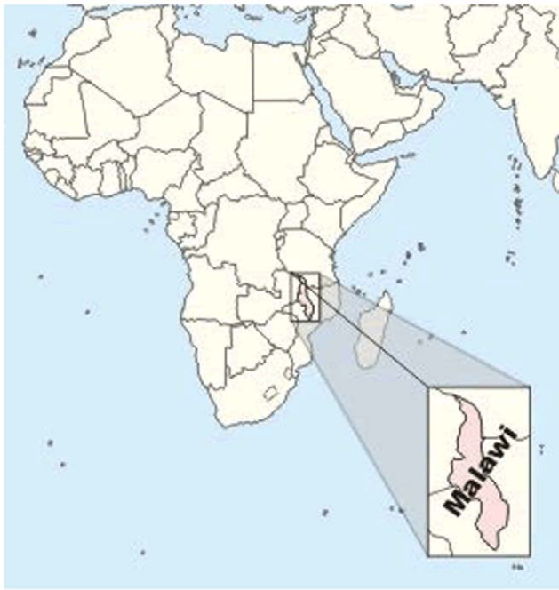
Figure 1. Map of Malawi in Africa. (source: http://www.un.org/depts/Cartographic/map/profile/malawi.pdf ). doi:10.1371/journal.pone.0033765.g001

(QECH) in Blantyre. QECH is the largest hospital in Malawi. It provides all levels of care, from primary to tertiary to patients within Southern Malawi. The QECH is the only public hospital within Blantyre District. Blantyre has a population of 1 million. It is the second largest city in Malawi after the capital city, Lilongwe (figure 1) [12].