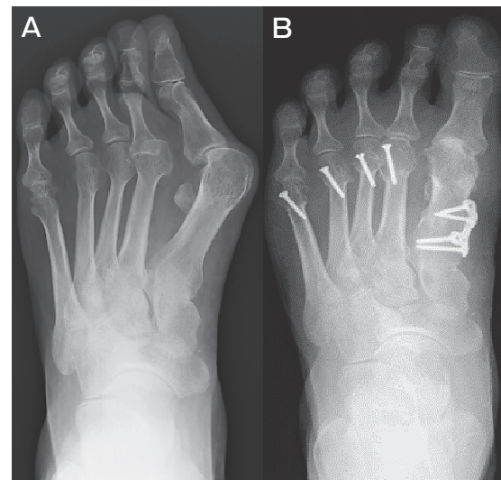
Fig. 3 Radiographs showing before (A) and after shortening oblique osteotomy for lesser metatarsal bone with screw fixation (B). For the 1 st metatarsal bone, correction osteotomy and plate fixation was done.

Radiographic assessment. The average amount of shortening of the metatarsal bone after the surgery was 4.1 \pm 1.9 mm. Preoperative dislocation of the MTP joint was noted in 39 toes of 20 feet. In these toes, the average preoperative extent of dislocation of the MTP joint was 6.1 \pm 2.3 mm, and the average amount of shortening of the metatarsal bone after the surgery was 4.6 \pm 2.0 mm. In the 39 toes without MTP joint dislocation, the amount of shortening of the metatarsal bone after the surgery was 3.6 \pm 1.7 mm,