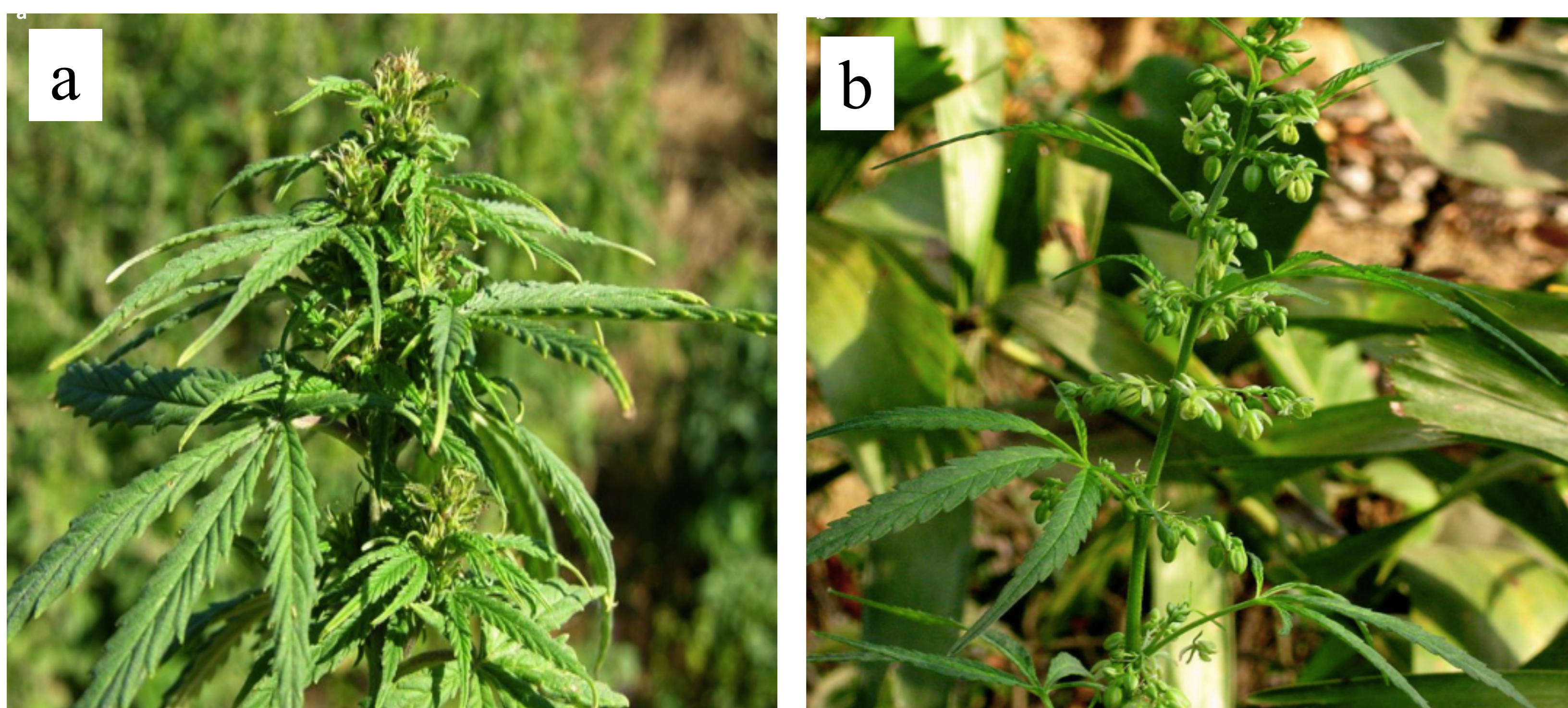
Figure 1. Cannabis sativa L. Female plant (a) Male plant (b).

Cannabis sativa L. is a dioecious , flowering plant (Figure 1). The plant requires 12-13 hours of light per day, enough water , the pH of soil between 5-7,5, to obtain products of high quality (Figure 2).