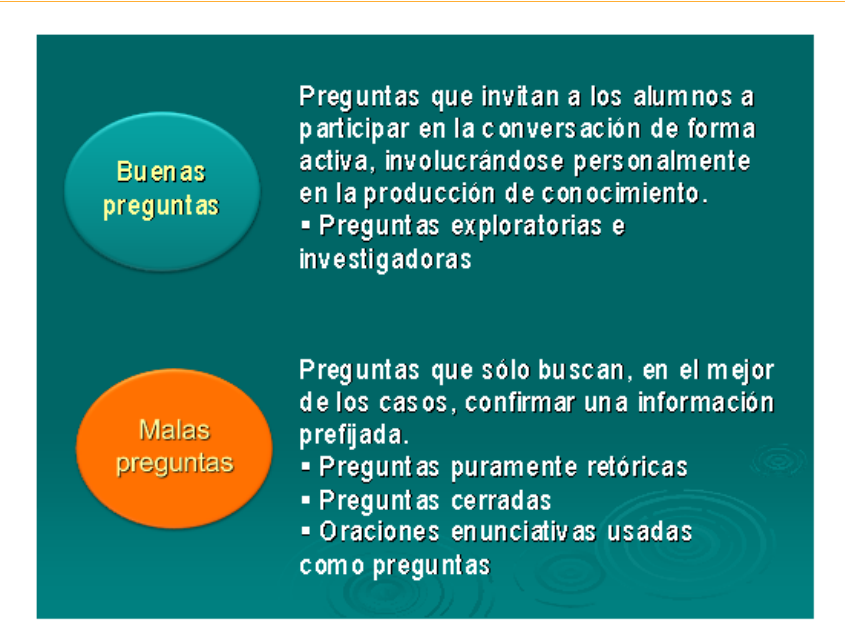
Figure 1. Sample slide