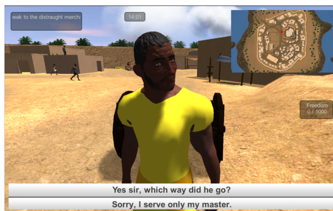
Fig. 6: Streets of Uruk

simulation and means of interacting with the Uruk simulation. In order to best educate simulation participants we have decided to create a simple plot, which human participant can follow in order to best discover the city, its history and the sumerian culture occupying it. To follow this plot, human has to interact with agents and object to listen to their stories. The dialogue trees have been implemented using the NodeCanvas plugin, which also visualises dialogues in the game. Figure 6 depicts an interaction with one of the agents. It also shows the simple game interface with the mini-map and several GUI elements showing the progress in the game.