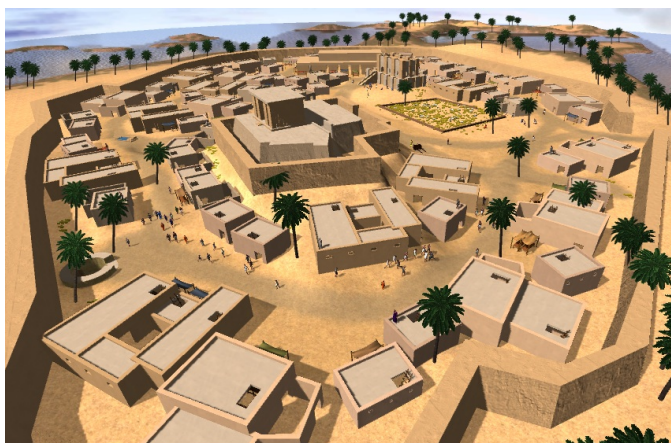
Fig. 1: 3D Visualisation of the city of Uruk 3000 BC