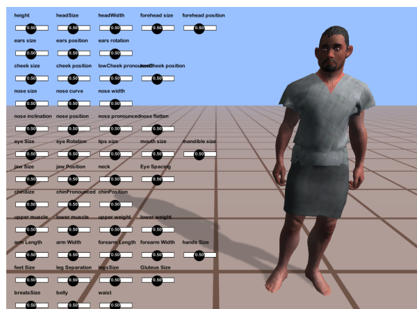
Fig. 2: Unity Multipurpose Avatar - Modification

with models of physiological needs, so that agent goals can be automatically generated through these needs (like hunger, thirst, fatigue, etc.) becoming more pronounced. The agents must have a way to react to these needs in a way appropriate for the social role the agent is playing in the reconstructed society. Thus, to make this possible we formalise the role flow and social norms of the reconstructed society (that we label as institution). The institution permits agents to find a plan of actions that leads to satisfying each of the needs, while keeping this plan in accordance with the role played by the agent. Finally, to increase believability and improve diversity of agent actions we supply agents with diverse personalities, so that actions of others and the state of the environment may affect an agent's emotional state and result plan variations in response to the same goal. Further we highlight the technical details of the aforementioned techniques. This process is separated into six steps, following the methodology from [2].