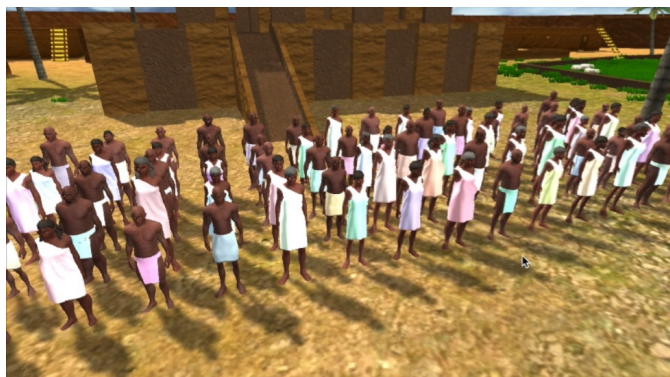
Fig. 4: Generated Crowd in Unity 3D

Then, using approaches from genetic algorithms, by combining chromosomes from two parents we reproduce the rest of the population automatically, where each new avatar is unique. Figure 4 depict a generated crowd of 100 agents in Unity3D.