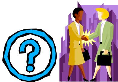
Figure 2. SPPA cue for sentence 1 of Script 2. [Patient Name] meets someone for the first time, so he asks, “What is your name?” What does he ask?