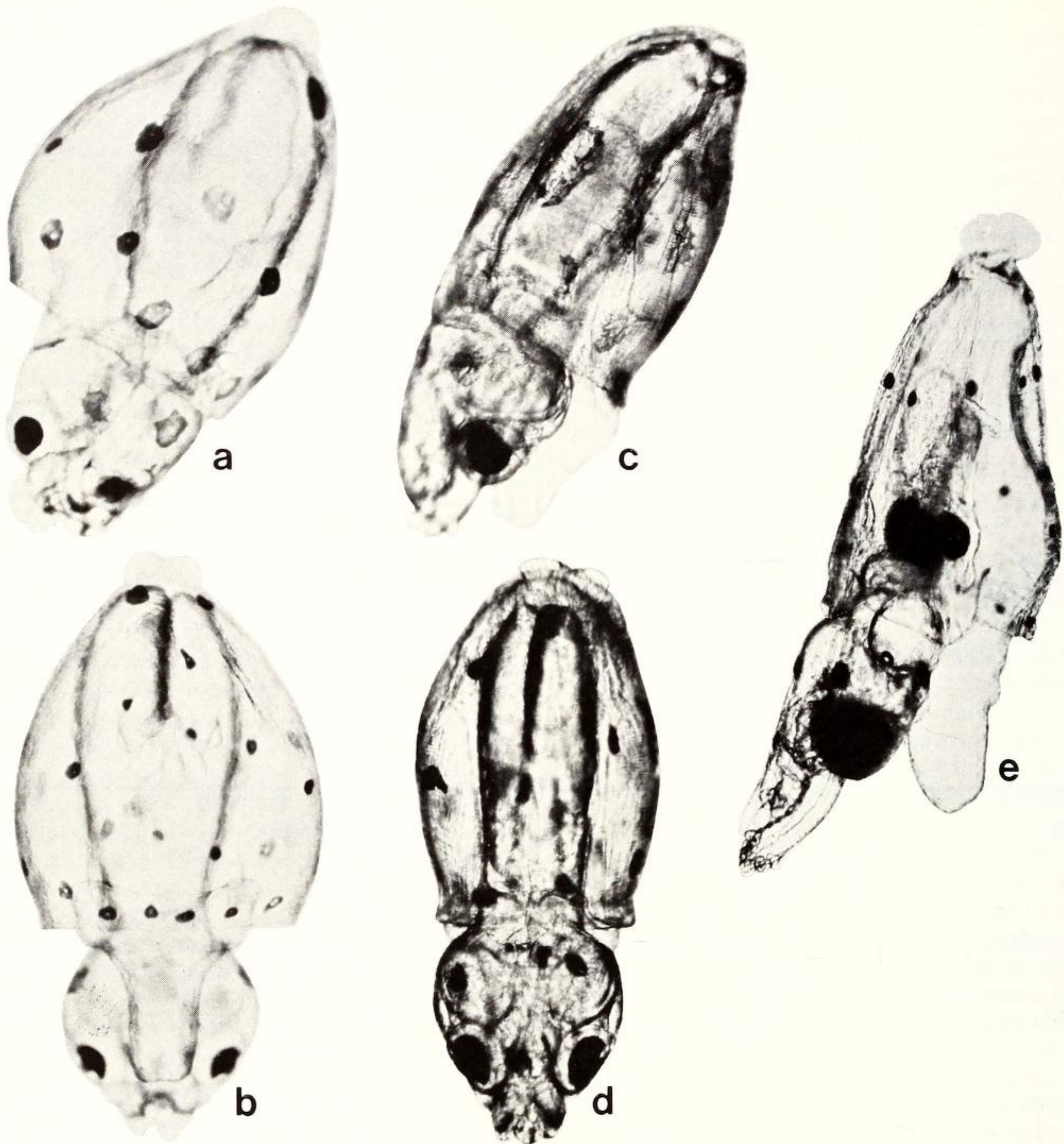
Fig. 2. Illex illecebrosus embryo and hatchling photographs used to calculate yolk volume. a) and b) are top and side views of Stage XVII embryos. c) and d) are recently hatched Stage XX embryos. e) is one of the most advanced hatchlings seen to date seven days post-hatching. Its yolk reserve is nearly developed, and it is near starvation.

disadvantage to development at high temperature.