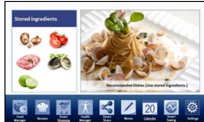
Fig. 2. A priming images on the display panel.