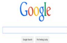
Fig. 1. Google.

purchases) as compared to Western gamers [5]. These tendencies and preferences may be attributed to the nature of Westerners' culture that enjoys doing challenging tasks and activities.