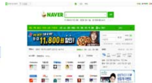
Fig. 2. Naver.com.

Furthermore, studies have revealed that culture also had influence on an individual's needs, preferences and expectations towards education [6–8]. For example, Western learners expect constructivist learning approach in contrast to Eastern learners, thus Western learners prefer to utilize social constructivist tool such as e-learning, Wikipedia and Facebook [6, 9, 10]. Additionally, the instructional expectations among learners are also vary across culture [6]. Learners from Nordic countries (e.g. Sweden, Norway and Denmark) expect constructive feedbacks as compare to learners from South Africa countries. Hence, utilizing cultural aspects in education particularly in serious game could assist to address the learner's learning needs, preferences and expectations; thus improves learner's academic performance.