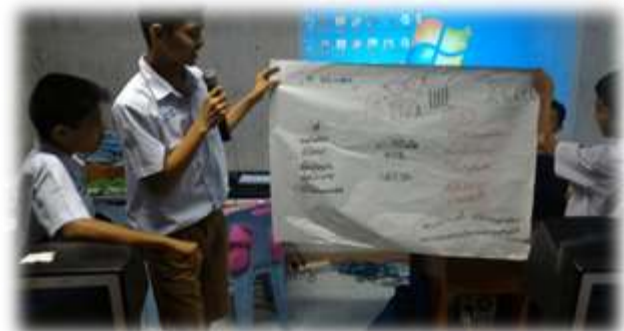
Figure 1. Social media activities in four world-class standard schools in Nakhon Si Thammarat Province.

Figure 1 shows the social media activities from students in our survey. After, the social media activities finished, the students discussed social media literacy. They thought social media is good for knowledge transfer and learning management. Most students know about advantages and disadvantages that come from using social media. They know how to externalize their Facebook page. Therefore, most students feel aware of using social media and can complete all levels of media literacy. However, some students did not know about this, thus, it is an issue incumbent on teachers and parents to provide good advice and guidance in how to use social media responsibly.