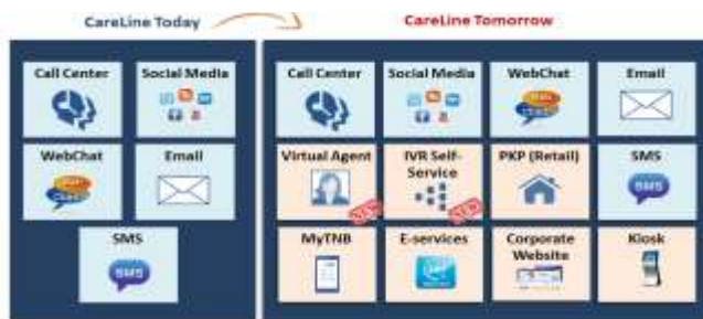
Figure 1. All Channels of Communication in WCCC

CMC and OSEC agents are trained to be the expert regarding any services in TNB. KM initiatives need to be implemented in WCCC to ensure that the agents will be competence enough to perform their duties in the contact centre.