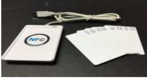
Figure 3. NFC Reader and Tag

Mobile application is to be used by the lecturer and student. The student uses the mobile application for takes and check attendance. The lecturer uses it to view the class statistics and student attendance.