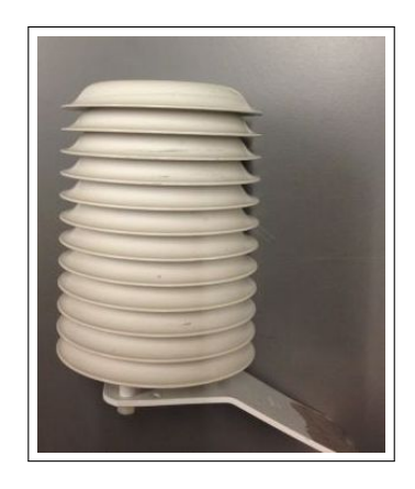
Figure 3: Combined air temperature and humidity sensor