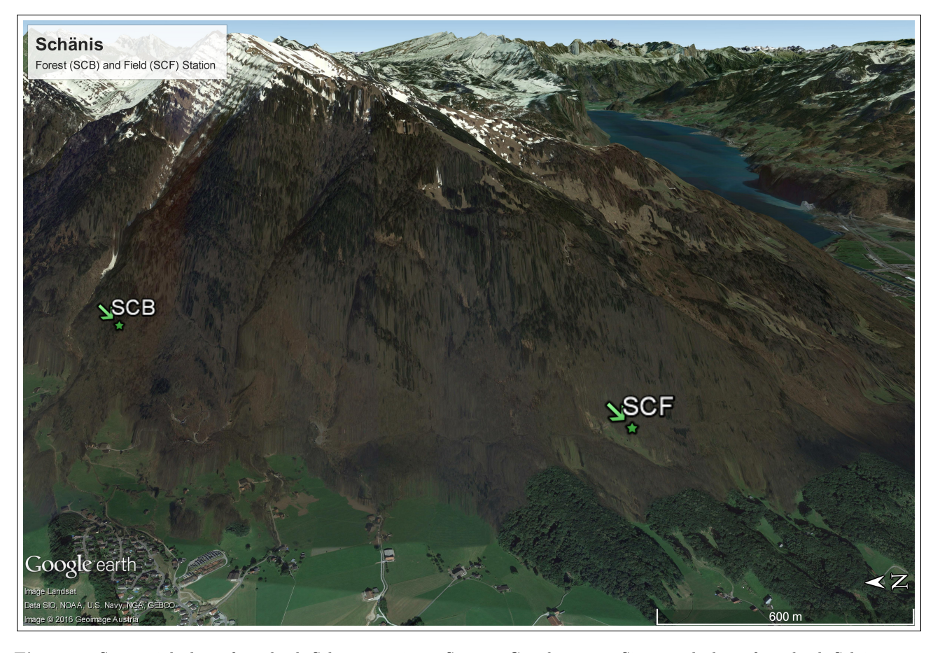
Figure 1: Site aerial photo from both Schänis stations.

The measurements were carried out at Schänis in the Swiss Canton of St. Gallen, located between the Lake of Zürich and the Walensee (Fig. 1). Time series of two plots have been recorded, one within the forest (Fig. 2a) and a second one outside of the forest (field station, Fig. 2b). Tab. 1 shows further details on the research station characteristics.