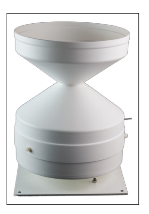
Figure 4: Precipitation sensor