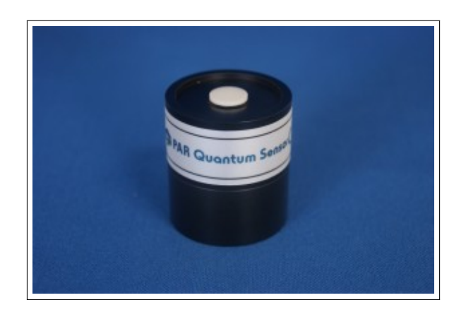
Figure 5: PAR sensor