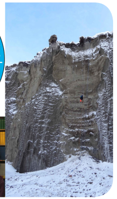
Top left: Logo of the Yedoma IPA Action Group. Bottom left: Action Group meeting in Potsdam, November 2015; Right: Itkillik Yedoma exposure, Alaska.

AGU conference itself. Currently, the group is preparing a first Yedoma synthesis manuscript.