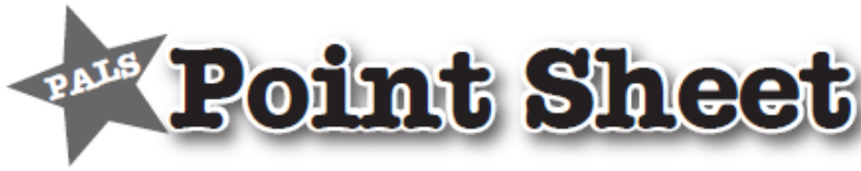
Figure 9. Point Sheet