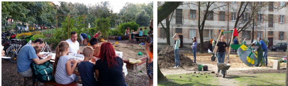
Figure 2: Motivated neighbourhood communities (left: Budapest; right: Riga)

In Latvia, one of the activities that have contributed to residents’ participation in the regeneration of the residential environment is the so-called Courtyard Refurbishment Movement. This project aims to encourage people to engage in the improvement of the areas surrounding their housing. The Courtyard Movement was created within the framework of the “Big Clean-up” – a project whose aim was to help people discover their common points of view and to learn how to cooperate. Priority was given to applications that would encourage active participation of local residents during and after the project development of the courtyard landscaping. A wide range of stakeholders was involved in the various activities throughout the process: local residents, students from different fields, professionals as mentors, representatives of local government and sponsors.