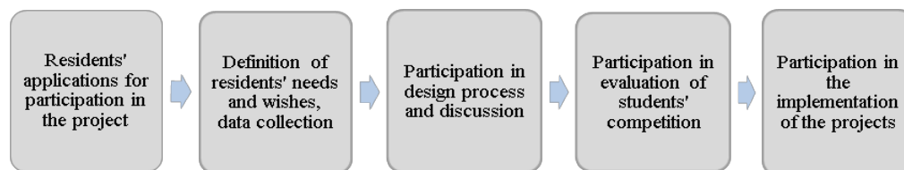
Participatory process in Courtyard Movement project in Riga