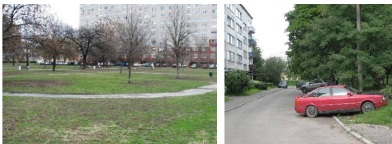
Figure 1: Underused green areas of the case studies (left: Budapest, right: Riga)