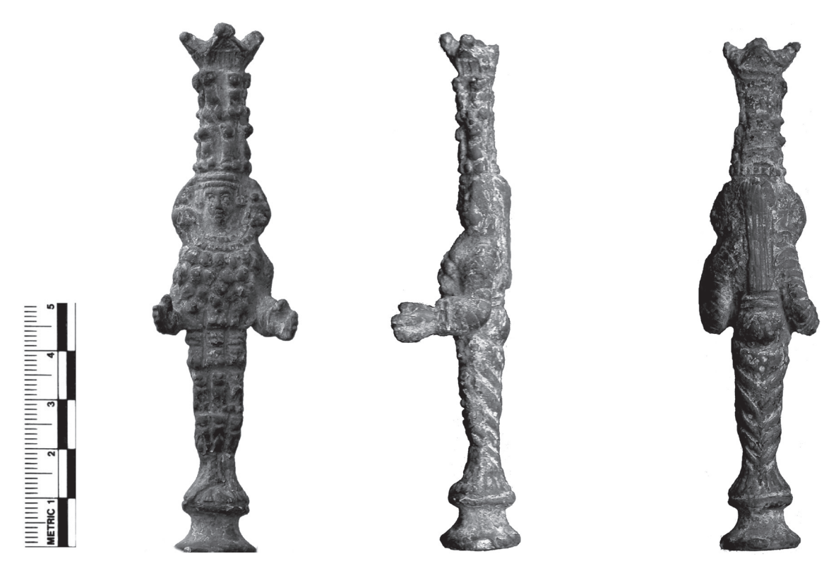
Fig. 5. a: Statuette of Artemis Ephesia from Apulum. Frontal view (Photo: National Museum of Union, Alba Iulia); b: Statuette of Artemis Ephesia from Apulum. Lateral view (Photo: National Museum of Union, Alba Iulia); c: Statuette of Artemis Ephesia from Apulum. Back-view (Photo: National Museum of Union, Alba Iulia)

the Kunsthistorisches Museum are masterpieces of Italian workshops and reflect the possibilities and economic status of the local elite.<sup>26</sup>