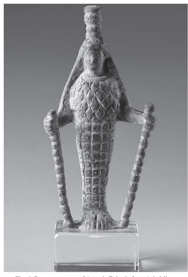
Fig. 6. Bronze statuette of Artemis Ephesia from Asia Minor (Museum of Fine Arts, Boston, cat. nr. 66.951.)

The polos of the canonical Great Artemis<sup>39</sup> – copied in various forms also by some provincial examples<sup>40</sup> – is divided in three registers: the upper one is an architectural form with a tetrapylon and tympanum decorated