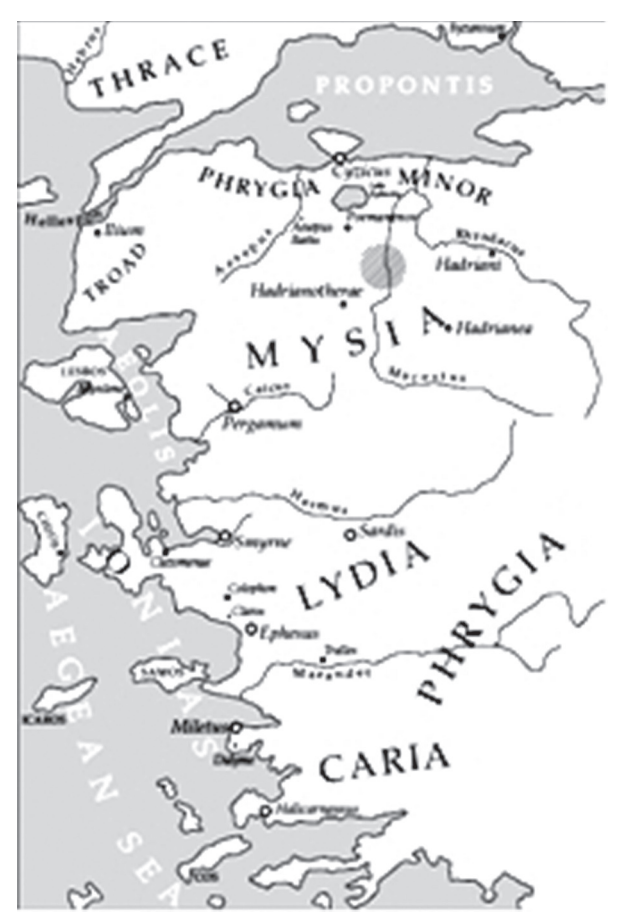
Fig. 1. Pilgrimage of Aelius Aristides (ELSNER-RUTHERFORD 2005, 277, fig. 4)

the divinity with her mythical origins: "But all cities worship Artemis of Ephesus, and individuals hold her in honour above all the gods. The reason, in my view, is the renown of the Amazons, who traditionally dedicated the image, also the extreme antiquity of this sanctuary. Three other points as well have contributed to her renown, the size of the temple, surpassing all buildings among men, the eminence of the city of the Ephesians and the renown of the goddess who dwells there". 19