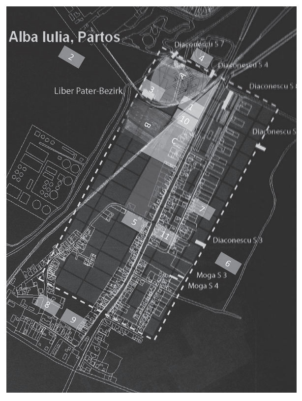
Fig. 10. Map of Colonia Aurelia Apulensis with the main researched areas. The darker area marks the territory, where the statuette was probably found. Legend: A: geophysical survey of the Apulum Project from 2003; B: aerial photograph of the Apulum Project by W. Hanson and I. Oltean; C: area examined by K. Gooss in 1867 and excavated by Cserni. Nr. 1: the big house excavated in 1911; Nr. 2: Roman spring and possible shrine of Silvanus; Nr. 3: Liber Pater shrine; Nr. 4: Asclepieion or the so called "Locus Apulensis"; Nr. 5: Roman Forum, findspot of the Hercules Apulensis; Nr. 6: Deus Aeternus shrine; Nr. 7: house with mosaic representing the winds; Nr. 8: possible Mithraeum of Károly Pap; Nr. 9: possible Iseum; Nr. 10: temple of Jupiter described by K. Gooss; Nr. 11: temple ruin in the garden of Gligor Sas

The civil settlement was well known for its various groups from Asia Minor attested through epigraphic sources. A particular inscription (IDR III/5, 62) dedicated to Diana Mellifica sacrum (the honey maker Diana) long associated with indigenous Dacian religion<sup>53</sup> is in fact, a direct evidence for the cult of a certain Artemis from Asia Minor or Greece.<sup>54</sup> Associated with the above mentioned, honey maker bees and bears (for example, Artemis Brauronia),<sup>55</sup> the presence of Diana