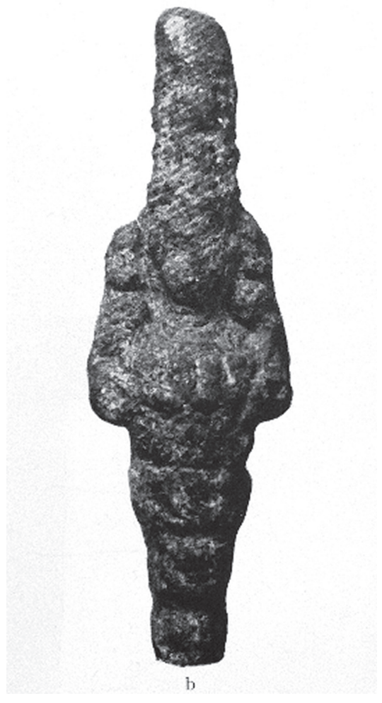
Fig. 8. Bronze statuette of Artemis Ephesia (Istanbul, Arkeoloji Müzesi, cat. nr. 2529. Photo: Fleischer 1973, taf. 43b)

inside with a circular motive, which appears again, schematically and oversized in our case. <sup>41</sup> The building was interpreted as the new neokorinthian form of the Artemision after 129 A.D. in Hadrian's time although it's functionality it could be related more with the city-goddess (Tyche) role of Artemis from Ephesus. <sup>42</sup> In the case of the Apulum statuette however, the building – represented in an exaggerated size – has an acroterion on the tympanum , <sup>43</sup> which suggest, that Knibbe's idea could be plausible. <sup>44</sup> Similarly to the majority of the post-Hadrianic representations, the aedicula appears three times in different angles and directions as a four column type building, not represented however on the backside of the statuette. <sup>45</sup>