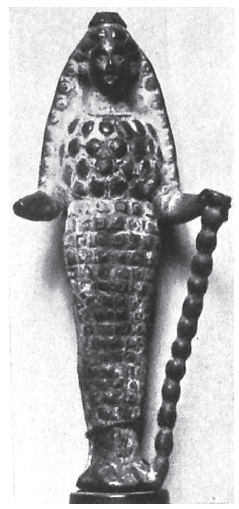
Fig. 7. Bronze statuette of Artemis Ephesia (Bologna, Museo Civico, cat. nr. 854. Photo: THIERSCH 1935, Taf. XXXIX nr. 13)