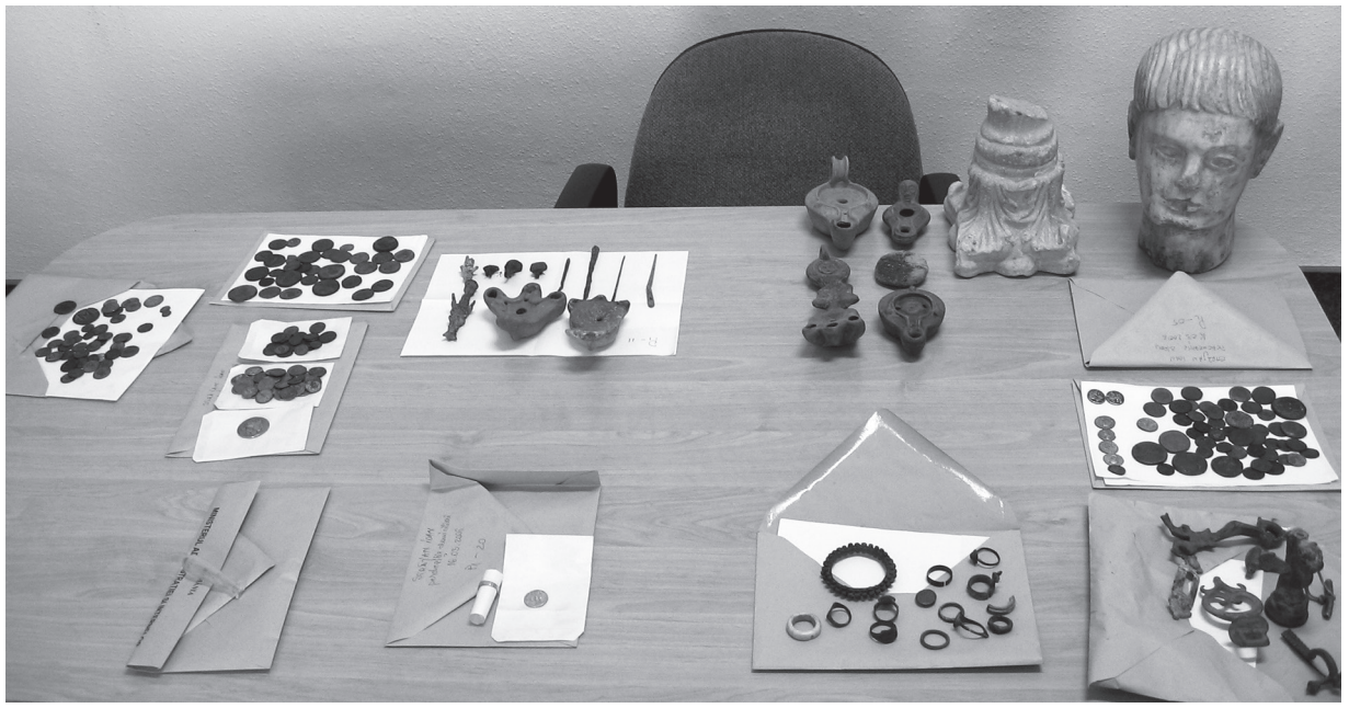
Fig. 11. Artefacts rediscovered by local authorities in Alba Iulia