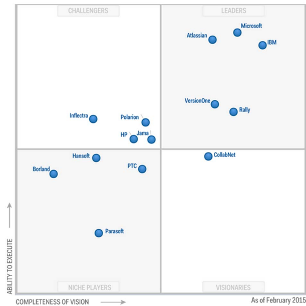
Figure 1. Important vendors and their performance [29]

Moreover, Automotive SPICE [10] and MDevSPICE [11] has to be mentioned as further directives with traceability related ordinance for autos and medical devices.