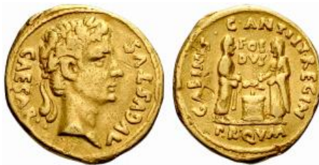
Fig. 25. Antistius Reginus, aureus . Obv.: CAESAR AVGVTVS, oak-wreathed head, rev.: C·ANTIST·REGIN GABINVS FOEDVS, two veiled priests facing each other, sacrificing a pig over a lit and garlanded altar, below: P R QVM (Bahrfeldt 184.1 = Calicó 123 = B. Antestia 17 = BMC 118; C 346; CBN p.113* = RIC 411).