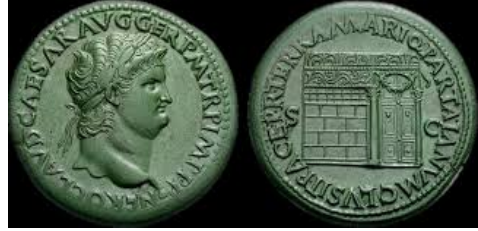
Fig. 35. Neronian aes showing the closed Gates of Janus.

Augustus crowning the late Agrippa (who was especially tall) with a star as part of the funerary issue along with the equestrian statue mentioned above. This interpretation would certainly support my claim that Agrippa's star was on the rise in 13 BC to the standing of junior emperor, but the coin appears to infer a divine status on the second figure, which might be a statue rather than a person. I suspect the denarius has nothing to do with Agrippa, but marks the 40th anniversary of Philippi. The best guess is that the Divine Julius, holding Augustus' clipeus virtutis places a sidus Iulialis over the head of a statue resembling the Prima Porta Augustus (Figs. 34–35). 16