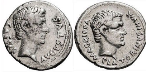
Fig. 10. Augustus and Agrippa, denarius , Rome, 13 BC. Obv.: bare head of Augustus right, rev.: M AGRIPPA PLATORIN[VS IIIIVIR], bare head of Agrippa right (RIC 408; BMC 114; RCV 1726).