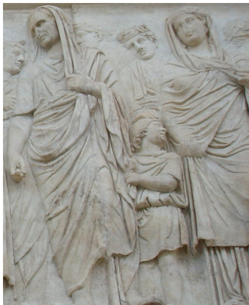
Fig. 36. Ara Pacis. Parthian child hanging onto Agrippa's toga.