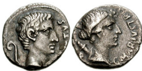
Fig. 23. Marius C F, denarius . Obv.: AVGVSTVS, bare head with lituus , rev.: diademed bust of Julia/Diana with quiver ( RIC I 403, RSC I [Julia and Augustus]).