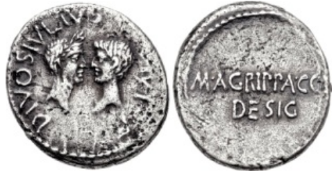
Fig. 4. Obv.: DIVUS IULIUS DIVI F, rev.: M·AGRIPPA·COS DESIG