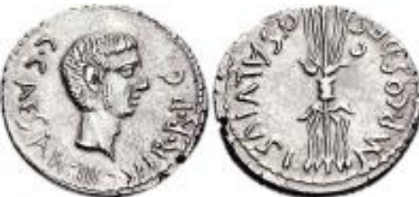
Fig. 7. Salvidienus Rufus, denarius , 40 BC. Obv.: C CAESAR III VIR R P C, rev.: thunderbolt, Q SALVIVS IMP COS DESIG