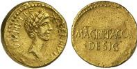
Fig. 3. Obv.: IMP·DIVI·IVLI·F·TER·III·VIR·R·P·C, rev.: M·AGRIPPA·COS DESIG