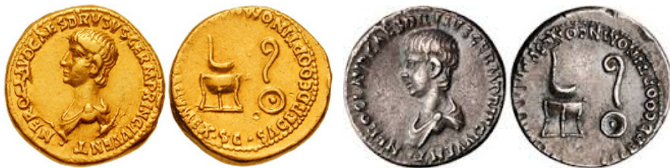
Figs. 29 and 30. Claudius, AD 52/53, denarius and aureus .

Obv.: NERO CLAVD CAES DRVSVS GERM PRINCI IVVENT – Bare-headed teenage Nero, rev.: SACERD COOPT IN OMN CONL SVpra NVM SC, simpulum , lituus , patera , tripod.