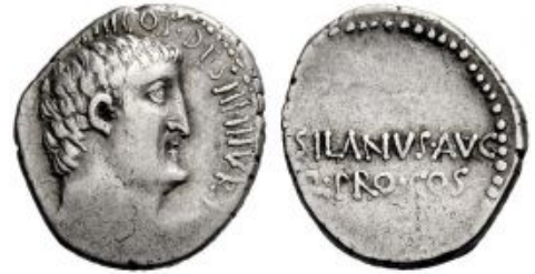
Fig. 8. Antony, denarius , 32 BC. Obv.: ANTON AVG IMP III COS DEC III III V R P C, portrait of Antony, rev.: M·SILANUS AUG Q PRO COS.