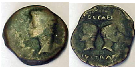
Fig. 22. Augustus aes of Julia Traducta, Hispania. Obv.: PERM CAES AVG, bare head left, rev.: C L CAES IVL TRAD, confronted bares heads of Gaius and Lucius Caesars (Cohen 185, SGI 165)