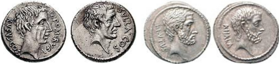
Fig. 11. Q. Pompeius Rufus, denarius , 54 BC. Obv.: head of Sulla, rev.: head of Q. Pompeius Rufus, evoking an ancestor and partisanship (Babelon Cornelia 48 and Pompeia 4 = Sydenham 908 = Cr 434/1).