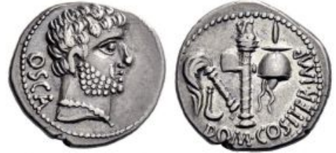
Fig. 6. Domitius Calvinus, denarius , Osca mint 39 BC. Obv.: bearded portrait OSCA, rev.: simpulum , aspergillum , axe, galeus , DOM COS ITER IMP (symbols of the Caesarian faction).