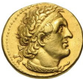
Fig. 39. Stater of Ptolemy I