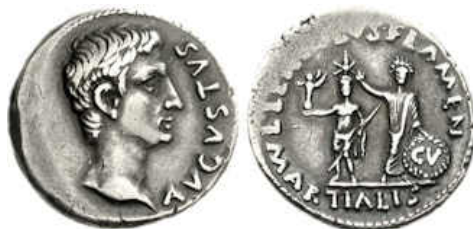
Fig. 33. Lentulus, denarius 12 BC.

Obv.: AVGVSTVS, bare headed, rev.: COSSVS CN • F • LENTVLVS, equestrian statue right of Cornelius Cossus, helmeted, bearing spolia opima over left shoulder, on pedestal, ornamented with two prows ( RIC I 412 = RSC 418 = BMCRE 122–123 = BMCR Rome 4672–4673 = BN 551–554).