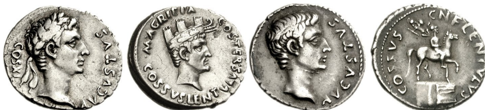
Fig. 31. Cossus Cornelius Lentulus, denarius 12 BC. Fig. 32. Cossus Cornelius Lentulus, denarius 12 BC.

Obv.: NERO CLAVD CAES DRVSVS GERM PRINCI IVVENT – Bare-headed teenage Nero, rev.: SACERD COOPT IN OMN CONL SVpra NVM SC, simpulum , lituus , patera , tripod.