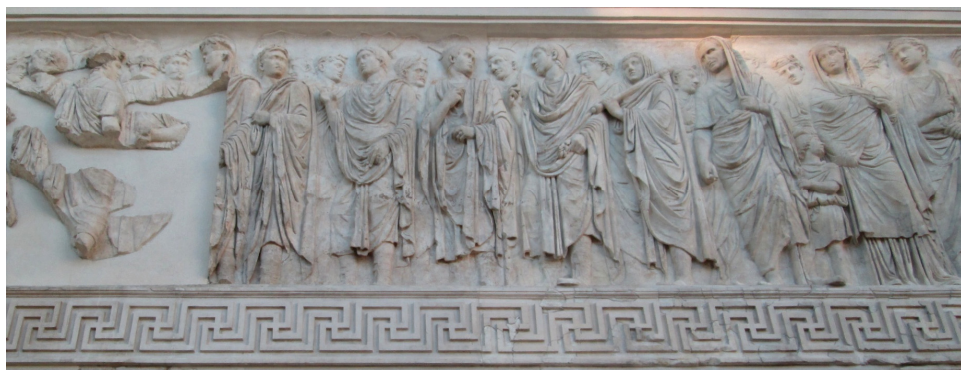
Fig. 37. Ara Pacis, South Wall. Pontifices , including Agrippa with covered head

On the Ara Pacis we first have ten lictors, followed by the Pontifical College, including Augustus. Other Pontifices follow, including Agrippa in almost a central position on the South Wall to attract attention (Fig. 37). His covered head shows his status as an officiating priest – this time within the Pontifical College. The presence of Agrippa and his wife Julia displays both domestic tranquility, as do the other marriages within the imperial family, and also the stability that Agrippa, as Augustus' son-in-law, will maintain should anything happen to Augustus. In more ways than one he is a transition figure, for not only will he preserve Rome if Augustus dies suddenly, here he appears in the Pontifical College and simultaneously begins the family