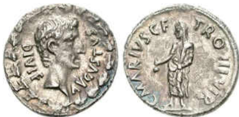
Fig. 24. Marius C F Tro(mentina tribu), denarius . Obv.: AVGVSTVS DIVI F, bare head right, all within oak wreath, rev.: C MARIVS C F TRO III VIR, Pontifex, veiled and togate, holding simpulum in right hand (RIC I 401, RSC 455a, cf. BMCRE p. 22, note; BN 527).