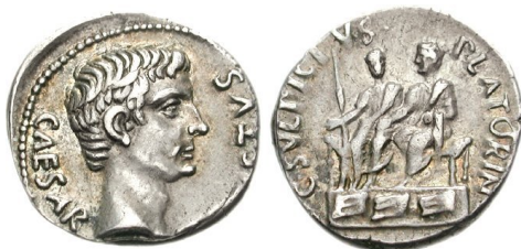
Fig. 15. C. Sulpicius Platorinus, moneyer denarius . Obv.: CAESAR AVGVSTVS, bare head right, rev.: C. SVLPICIVS PLATORIN, Augustus and Agrippa seated left on dais, ornamented with upright spear and three prows (RIC I 406, RSC 529).