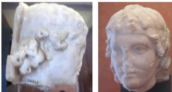
Fig. 40. Roman girl of the 1st century AD wearing a brill (not a diadem) (Verona Archeological Museum)