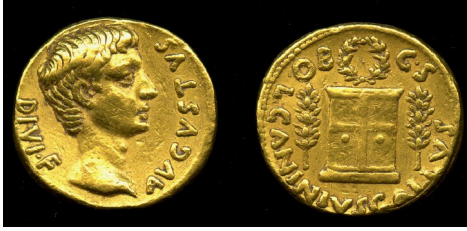
Fig. 34. Caninius Gallus aureus 12 BC. Obv.: AVGVSTVS DIVI F, head of Augustus right, wearing oak wreath, rev.: L CANINIVS GALLVS, OB C • S, laurel wreath above double closed door flanked by laurel branches.