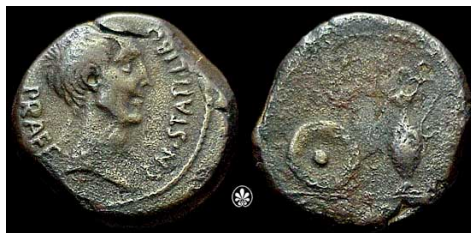
Fig. 9. Libo, denarius , Hispania. Obv.: head of Libo [CN STATI] LIBO [PRAEF], rev.: SACERDO Patera , capis .

approval of the gods, right before his downfall (Fig. 7). In 40 BC, Salvidienus Rufus, not Agrippa, was the right hand of the Young Caesar. Similarly, in 33 BC, M. Junius Silanus, advertised himself as the top quaestor on a denarius with the simple reverse M.SILANUS AUG.Q.PRO.COS much like that of Agrippa in 38 BC (Fig. 8). And soon after Agrippa shared the consulships of 28 and 27 BC with Augustus, Silanus did the same in 25 BC. Cn. Libo, as governor of Spain, like many other governors, minted coins of himself (Fig. 9).