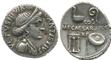
Fig. 27. Antistius Vetus, denarius 16 BC. Obv.: C·ANTISTIVS·VETVS·III·VIR, diademed and draped bust of Venus right, rev.: IMP CAESAR AVGV S, COS/XI in two lines above and below, simpulum , lituus , patera , tripod (RIC I 368 = RSC 348a = BMCRE 98 note ≈ BN 368 var).