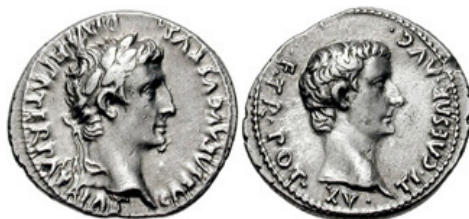
Fig. 14. denarius and aureus Lugdunum mint, 13–15 AD. Obv.: laureate head of Augustus, rev.: bare head of Tiberius.