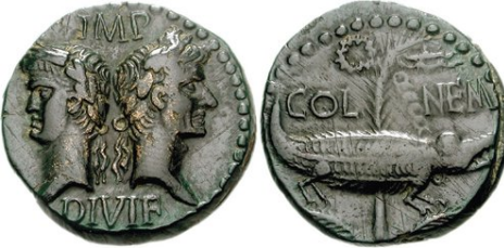
Fig. 5. Nemausus aes , 20 BC. Obv.: Augustus and Agrippa wearing oak and rostral-mural crowns, IMP P P DIVI F, rev.: crocodile (legionary emblem) palm tree, COL NEM