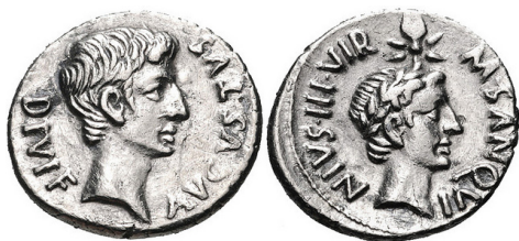
Fig. 13. M. Sanquinius, denarius , 17 BC. Obv.: AVGVSTVS DIVI F, bare head of Augustus, rev.: M SANQUINIUS III VIR laureate head of Divus Julius, comet or sidus Iulialis (RIC I 338, RSC 1).