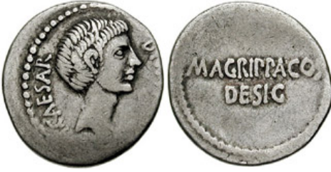
Fig. 1. Obv.: CAESAR DIVI F, rev.: M·AGRIPPA·COS DESIG