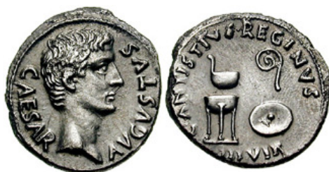
Fig. 28. C. Antistius Reginus, denarius . Obv.: CAESAR AVGVSTVS, bare head right, rev.: C·ANTISTIVS·REGINVS III·VIR, sacrificial implements: simpulum and lituus above, tripod and patera (RIC I 410, RSC 347, BMCRE 119–120 = BMCRR Rome 4661–4662; BN 542–547).