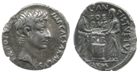
Fig. 26. Antistius Vetus, denarius . Obv.: IMP CAESAR AVGVS TR POT VIII, bare head of Augustus, rev.: C ANTIST VETVS FOR DVS P R QVM GABINIS, two veiled priests holding pig over altar right.