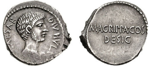
Fig. 2. Obv.: [IMP] CAESAR DIVI IVLI [F], rev.: M·AGRIPPA·COS DESIG