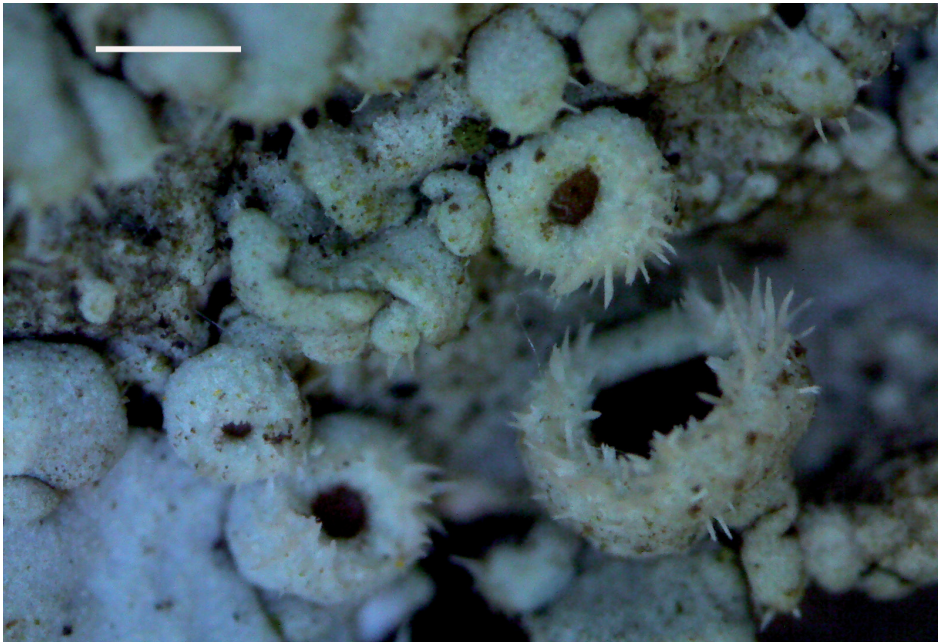
Fig. 3. Enlarged portion with apothecia of Phaeophyscia esslingerii (holotype). Scale 0.5 mm.