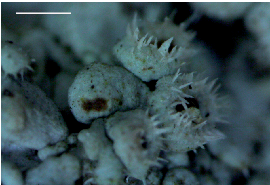
Fig. 4. Enlarged portion with apothecia and conidiomata of Phaeophyscia esslingerii (holotype). Scale 0.5 mm.